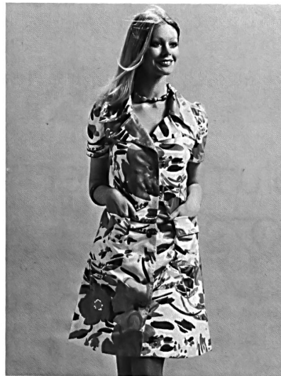
HAUSAMMANN TEXTIL AG WINTERTHUR

Deux-pièces en pur coton à frais dessin géométrique, porté avec une blouse en voile de coton uni.