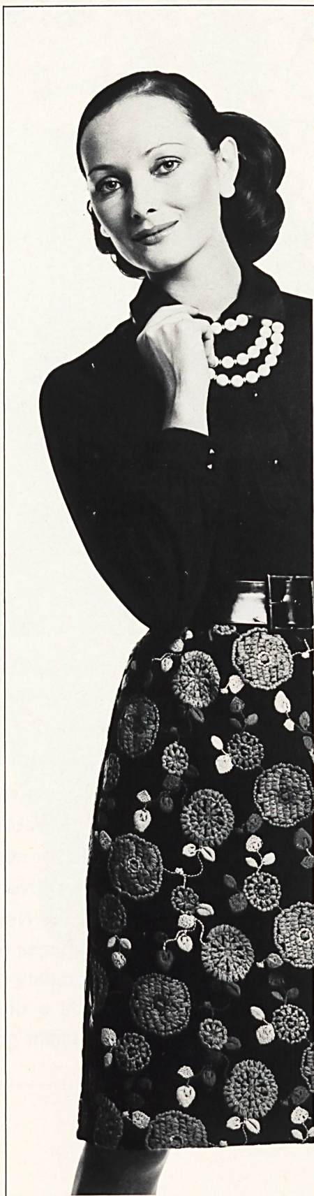
Short dinner dress. The shirt style top is in Abraham's black rayon jersey, the black skirt features multicoloured wool embroidery by Jakob Schlöpfer & Co. Ltd., St. Gall.

Irish-born John Cavanagh left St. Paul's School in 1932 and started his career "picking up pins" for the house of Molyneux in London and Paris. After spending the war years in the army, being demobilized as captain, he returned to Paris to work with Pierre Balmain until 1951. In 1952 he opened his couture salon in London and on presentation of his first collection was invited to become a member of the "Incorporated Society of London Fashion Designers". In 1953 he showed his collection with great success in Paris, in the USA and in Canada. During the International Trade Fair in