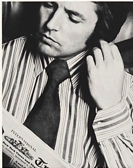
1. Torino Range in Terylene® by Stoffel Ltd., St. Gall. (Model: Chard of London).

Enquiries among British agents in London revealed that Swiss shirtings represent between 25 % and 85 % of their entire sales. This is reflected in the British shirt collections for Spring 1973 made up, in some cases, of up to 80 % Swiss fabrics and embroideries. The popularity of Swiss fabrics for day into evening shirts, and of embroideries for formal and dinner shirts, shows no sign of diminishing on the British market. In fact, if anything, the demand is still increasing, although price is an important factor. In spite of their labour and production problems, Swiss manufacturers manage to maintain the high quality standard for which their goods are reputed the world over. They always strive to be one step ahead of fashion, constantly producing new qualities and coming up with new design ideas, superb colours and, always, with enormous collections. This is where they score, for Swiss manufacturers are able to offer the British buyer a wide choice and exclusivity of design.