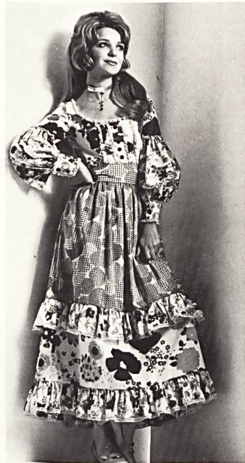
Romantically ruffled décolleté dress using three fine cotton fabrics by FISBA DE SAINT-GALL