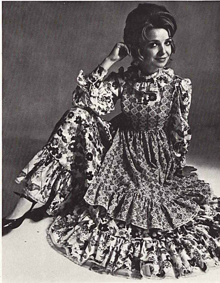
Exquisitely feminine "shepherdess" dress with a frilly apron in various printed cotton fabrics by FISBA DE SAINT-GALL