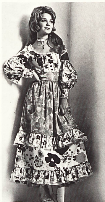
Romantically ruffled décolleté dress using three fine cotton fabrics by FISBA DE SAINT-GALL