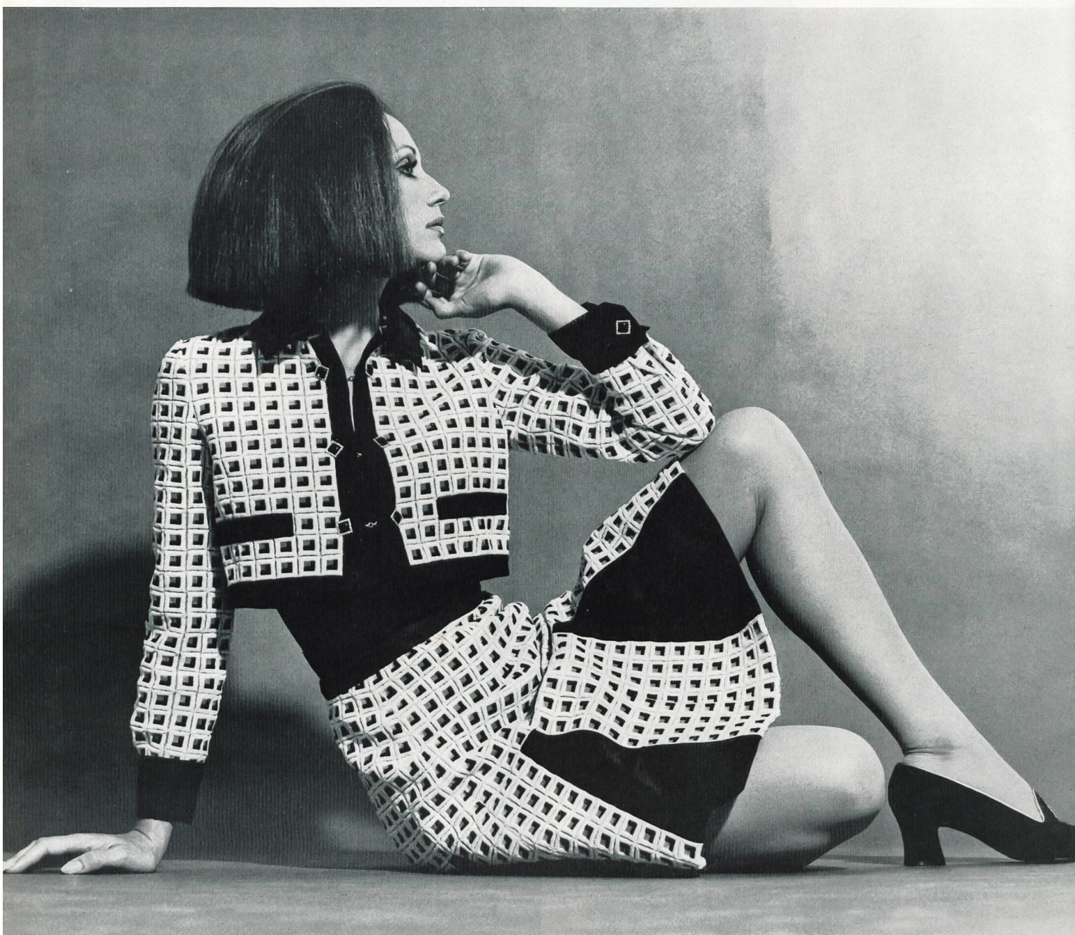
Model: Ognibene-Zendman, Rome