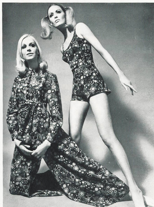
Lahco beach outfit: printed swimsuit in Helanca® and Antron® bouclé with cotton voile pyjamas to match printed with the same design.