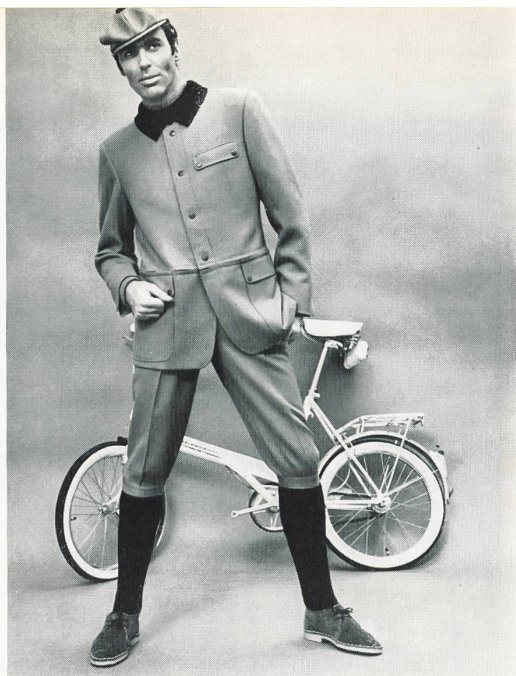
Ritex cycling outfit, in water-repellent pure wool; jacket with zip-on basques.