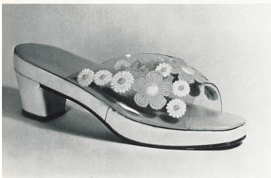
Bally shoes, regd. models

On the whole, a very successful show with collections of perfect quality and very high standard, due this year to the pitiless selection carried out before the parade.