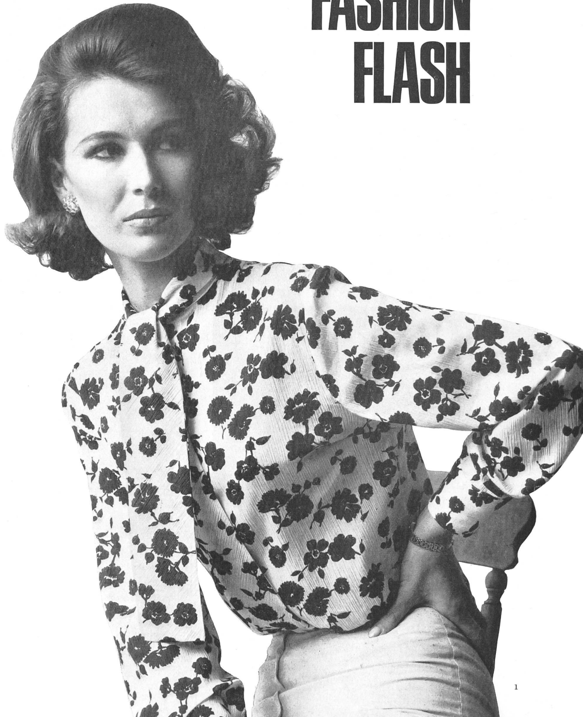
1 Reichenbach & Co. Ltd., St. Gall Printed cotton crêpon Model by Matisse of Bond Street