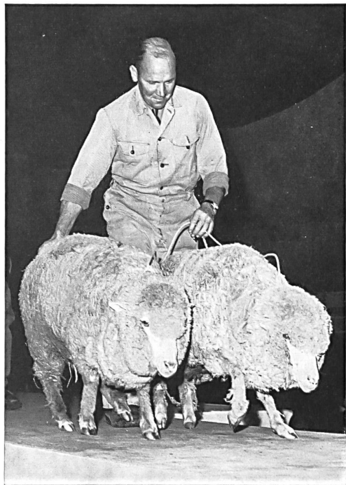
The presentation of two Australian merino sheep

Two features shared by the Swiss wool textile industry and the Bally footwear factory are that they both belong to the field of clothing and both maintain worldwide relations for their exports. These common interests encouraged them to give a very original and highly successful joint display last September in the magnificent gardens of the Bally Footwear Factory. Approximately 400 representatives of the press and various circles had been invited to Schönenwerd, where they were entertained, in a circus tent specially set up for the occasion, by different perfectly staged and produced «numbers». There was a very interesting series of lectures on technical subjects cleverly combined with documentary and fashion displays. Six merino sheep, flown in specially by Swissair (three from South Africa and three from Australia) and a number of Swiss sheep, paraded on the podium accompanied by mohair sheep, alpacas, llamas, sheep from Cashmere, moufflons and a camel kindly loaned by the Basle Zoo. To their amazement and great delight, the spectators were also treated to the shearing of two sheep by Swiss experts. A number of interesting details were revealed on this occasion such as, for example, that there are approximately 2000 different types of wool and that Switzerland's wool consumption is equivalent to 8 million fleeces. The fashion parade which followed showed wool in all its most varied aspects, from the garment for everyday wear to the evening dress in St-Gall wool