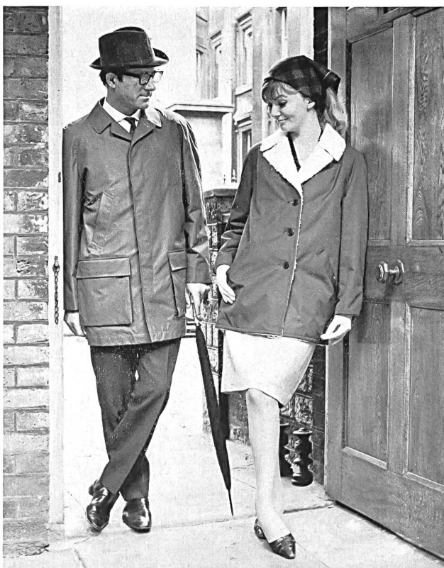
2 STOFFEL LTD., SAINT-GALL Tissu Aquaperl à finissage hydrofuge et antitaches Scotchgard Aquaperl fabric with Scotchgard rain and stain repeller finish Modèle: Telemac Ltd., London