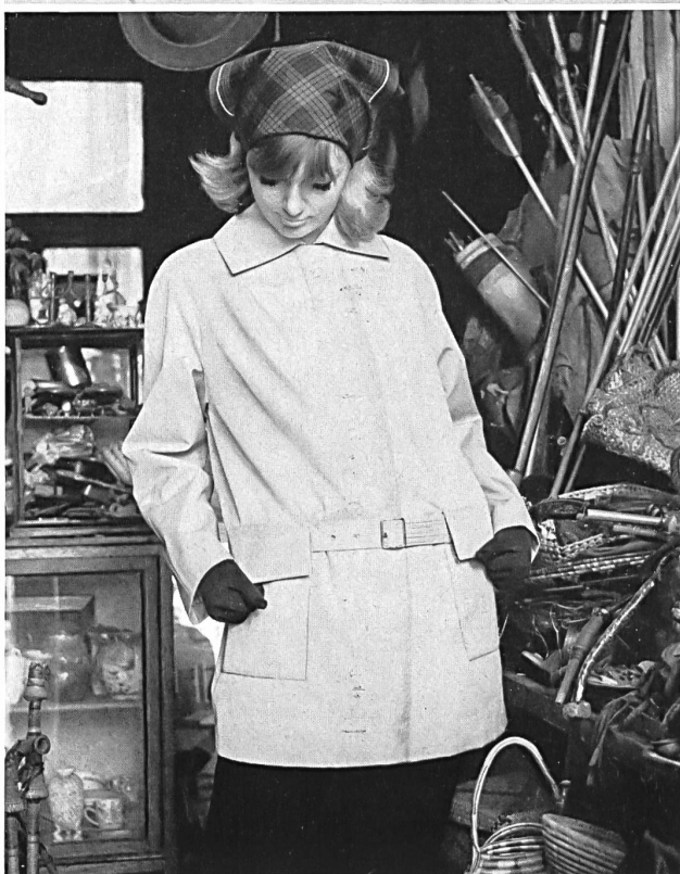
3 STOFFEL LTD., SAINT-GALL Tissu Aquaperl à finissage hydrofuge et antitaches Scotchgard Aquaperl fabric with Scotchgard rain and stain repeller finish Modèles: (à gauche / left) Heptex Ltd., Leeds (à droite / right) Cotsmoor Ltd., London