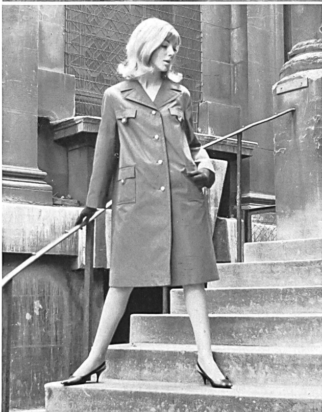
1 STOFFEL LTD., SAINT-GALL Tissu Aquaperl à finissage hydrofuge et antitaches Scotchgard Aquaperl fabric with Scotchgard rain and stain repeller finish Modèle: Morcosia