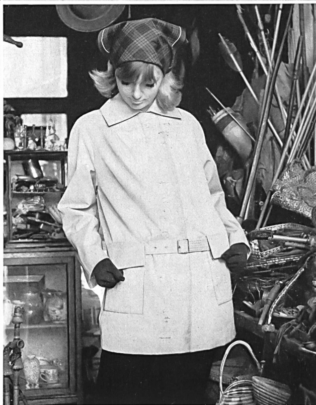
3 STOFFEL LTD., SAINT-GALL Tissu Aquaperl à finissage hydrofuge et antitaches Scotchgard Aquaperl fabric with Scotchgard rain and stain repeller finish Modèles: (à gauche / left) Heptex Ltd., Leeds (à droite / right) Cotsmoor Ltd., London