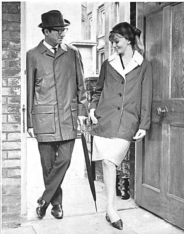
2 STOFFEL LTD., SAINT-GALL Tissu Aquaperl à finissage hydrofuge et antitaches Scotchgard Aquaperl fabric with Scotchgard rain and stain repeller finish Modèle: Telemac Ltd., London