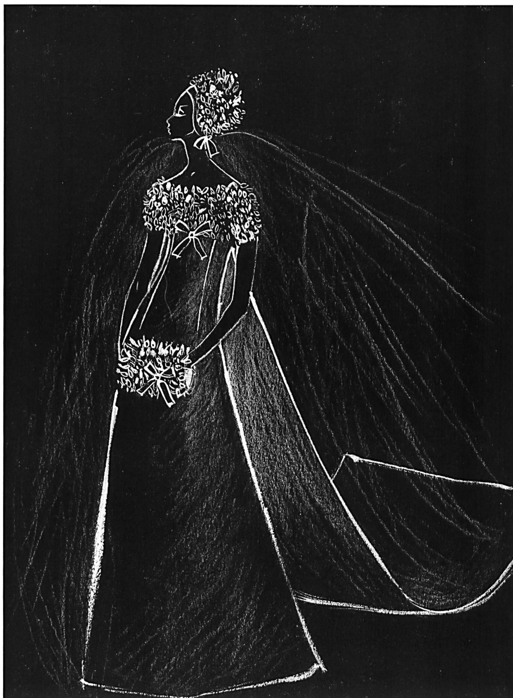
Robe de mariée en organza ivoire, avec guipure de: Bridal gown in ivory organza with guipure lace by: