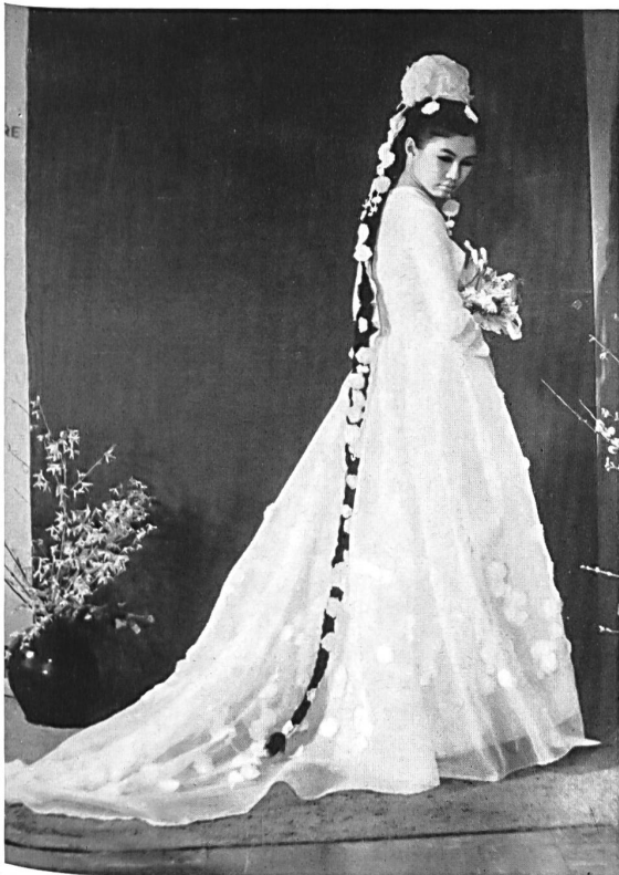
Bridal gown, 1st prize, Kingston Fashion School; train decorated with embroidery applications