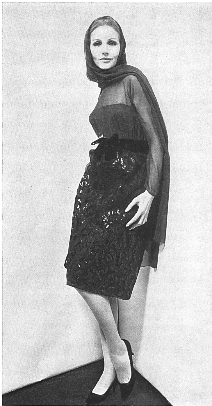
FORSTER WILLI & CO., SAINT-GALL

The black costume is still chic, but black must add some special note to compete with the flower-garden hues.