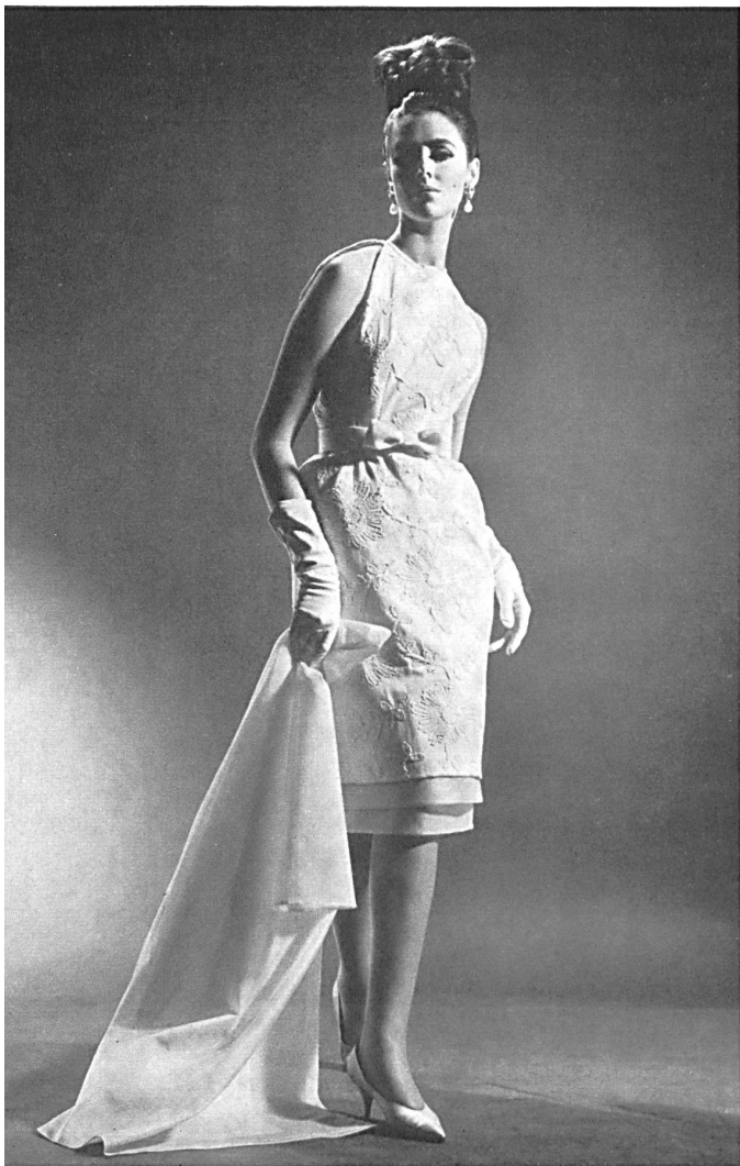
Shantung de coton brodé suisse Embroidered Swiss cotton Shantung Shantung de algodón bordado suizo Bestickter Schweizer Baumwoll-Shantung Modèle Jeanpalmério, Zurich