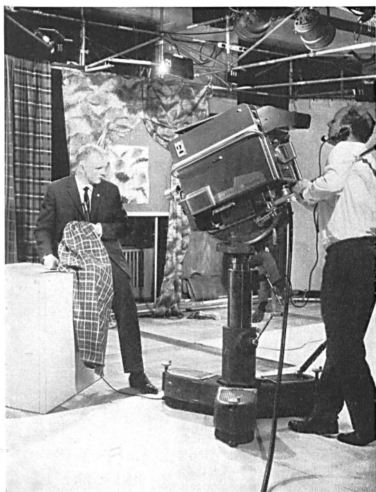
Prise d'un gros plan pour la retransmission par «Eidophore» Shooting a close-up for the «Eidophore» transmission Toma de un primer plano para ser retransmitido por el «Eidoforo» Nahaufnahme für «Eidophor»-Wiedergabe

The highlight of this year's event was the use of colour television on a big screen for part of the parade, with direct retransmission by means of the famous «Eidophore» apparatus. The Ciba chemical products factory