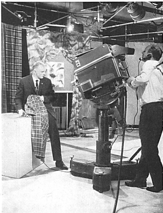
Prise d'un gros plan pour la retransmission par «Eidophore» Shooting a close-up for the «Eidophore» transmission Toma de un primer plano para ser retransmitido por el «Eidoforo» Nahaufnahme für «Eidophor»-Wiedergabe

The highlight of this year's event was the use of colour television on a big screen for part of the parade, with direct retransmission by means of the famous «Eidophore» apparatus. The Ciba chemical products factory