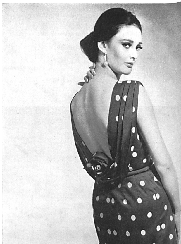
STOFFEL S. A., SAINT-GALL Shantung de coton à dessin plumetis Cotton shantung with dotted Swiss sample Shantung de algodón con dibujos de plumetis Baumwollshantung mit Plumetis-Dessin Modèle Couture Marianne, Saint-Gall

at the same time, the actual photographing of the parade for TV in a studio set up on the stage and the direct colour transmission of the scene onto the screen placed above it. The interesting feature of the use of the Eidophore process is that it makes it possible when desired to show the whole hall close-ups of details of the fabrics and embroideries used.