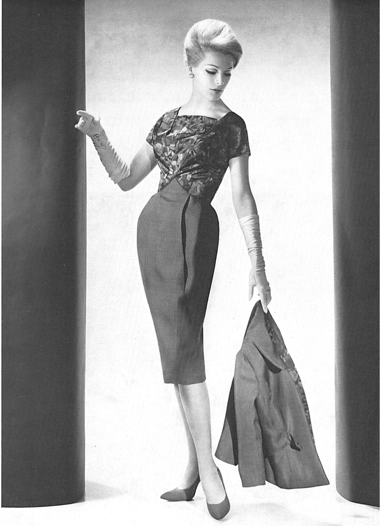
HEER & CIE S. A., THALWIL Plain pure silk shantung Shantung pure soie uni Model by Don Loper, Los Angeles

on suits and greatcoats. Both Novarese and Helen Rose display the now slightly widened shoulder and Novarese adds a padded raglan sleeve. Waistlines are lifted but not Empire; body shape is natural under a soft, released line rather than a sharply defined one. Novarese uses such Swiss specialties as chenille embroidered tulle,