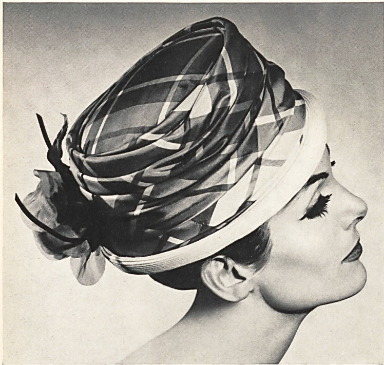
Soie imprimée suisse Printed Swiss silk Modèle Baroness Radvanszky, New York

fabrics. On all sides one hears the word «simplicity»; naturally, for the sophisticated abstract prints and interesting weaves call for simple lines.