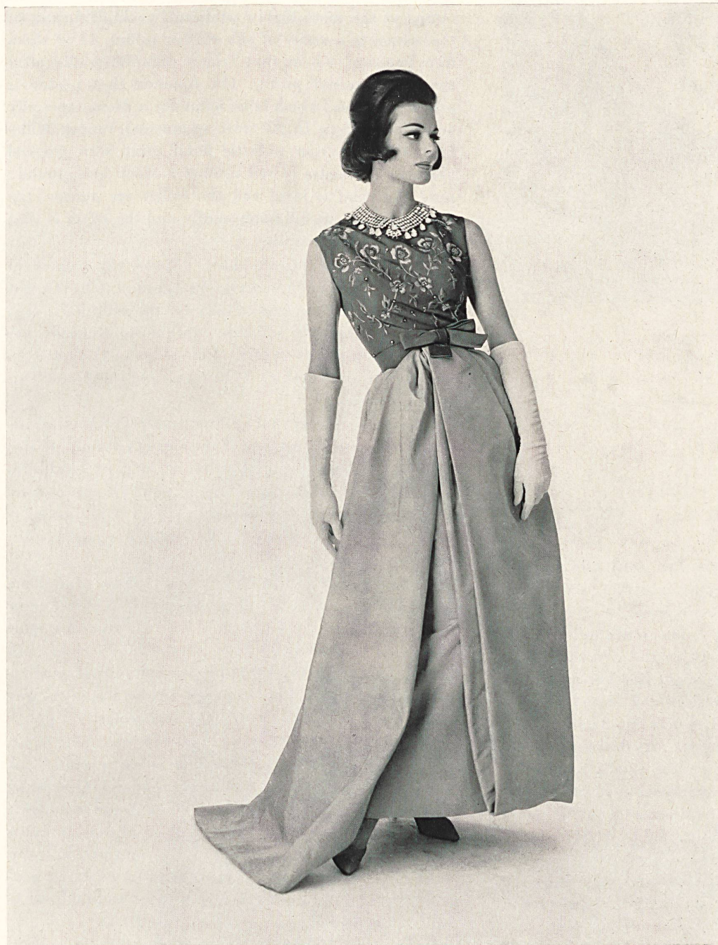
Faille pure soie suisse Pure silk Swiss faille Modèle Elizabeth Arden, New York

Fashion for American women grows more and more a matter of looking for the fabric first, and only afterward considering how that fabric is cut. At any social gathering after 5 p.m., the eye is dazzled by a variety of surfaces, of three-dimensional brocades, of embroidery and bead-