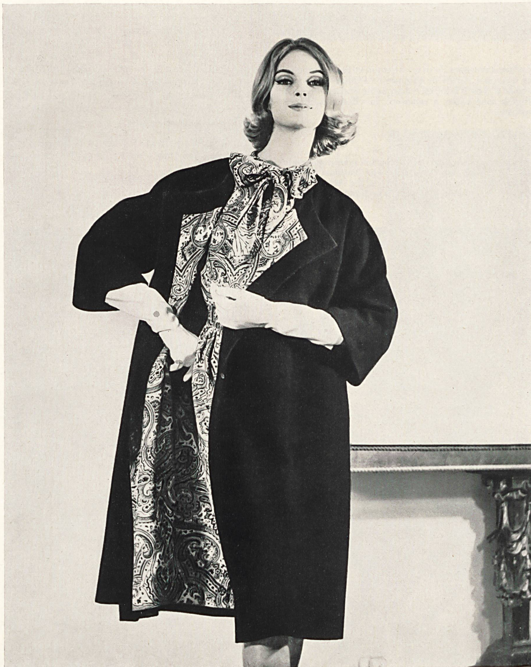
Mousseline de laine suisse avec impression cachemire Swiss paisley printed wool challis Modèle Vera Maxwell, New York