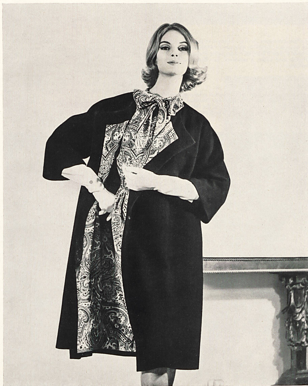
Mousseline de laine suisse avec impression cachemire Swiss paisley printed wool challis Modèle Vera Maxwell, New York