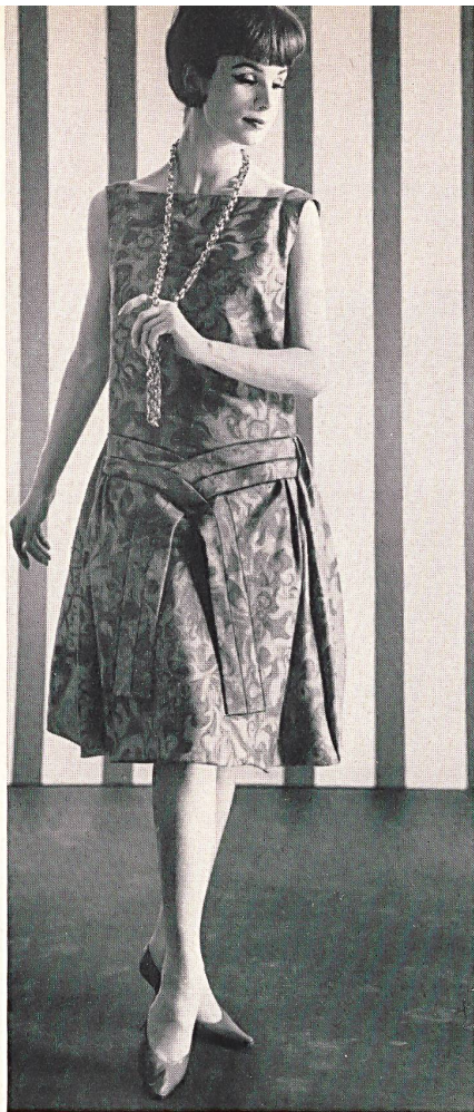
CHRISTIAN FISCHBACHER CO., SAINT-GALL ▲ Printed structured cotton fabric Modèle Couture Marianne, Saint-Gall