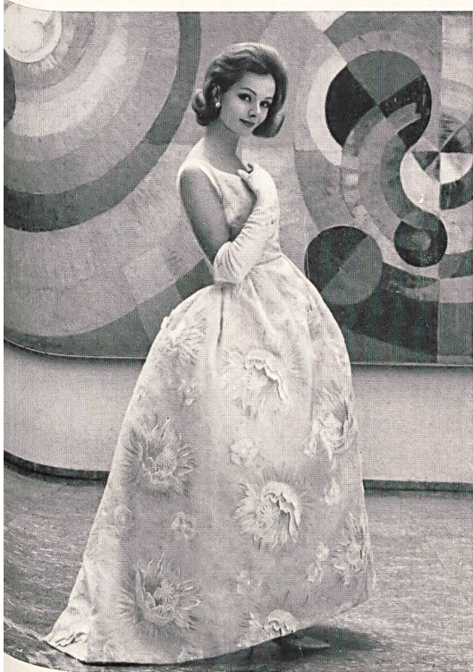
A. NAEF & CIE, FLAWIL Broderie - Embroidery - Bordado - Stickerei Modèle Mira, H. Grossenbacher AG., Zurich