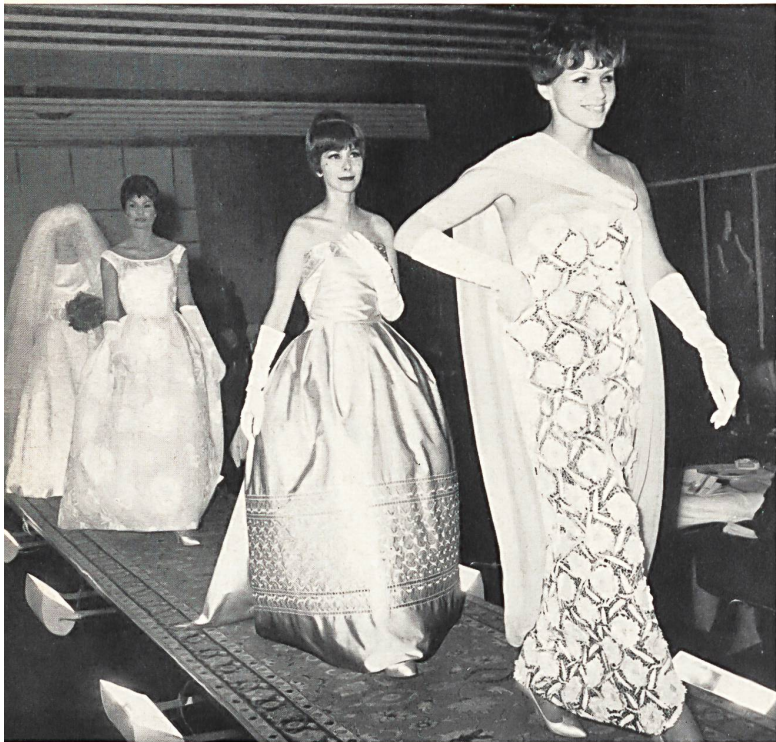
The presentation in the Zurich Museum of Fine Arts

«Textile creation considered as one of the fine arts» was the theme chosen by the organisers of this party in her honour, which was very fittingly held in the hall of the superb new Fine Arts Museum in Zurich.