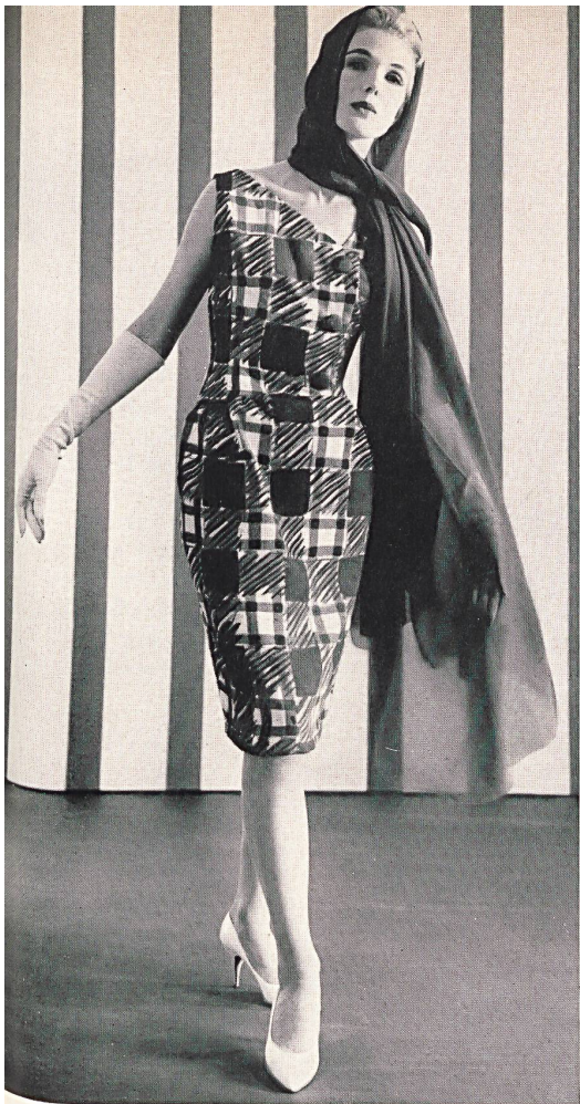
CHRISTIAN FISCHBACHER CO., SAINT-GALL ▲ Printed structured cotton fabric Modèle Jeanpalmério, Zurich