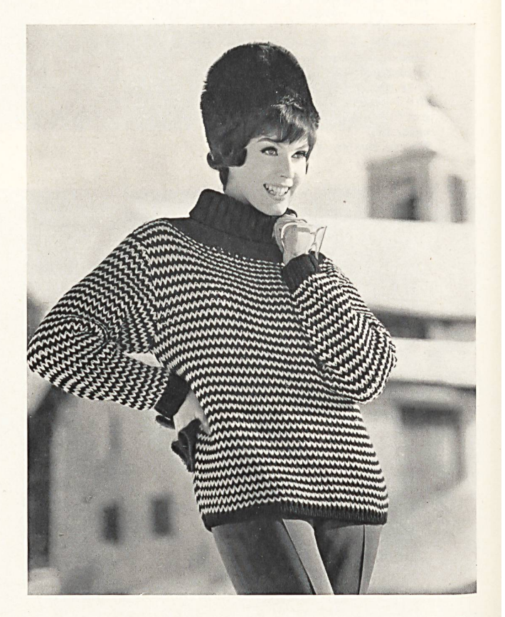
Sports and ski sweater in heavy two-toned knit, with roll collar fitted very low

Ski sweater in a modern jacquard design, with fashionable collar that can be worn open or done up