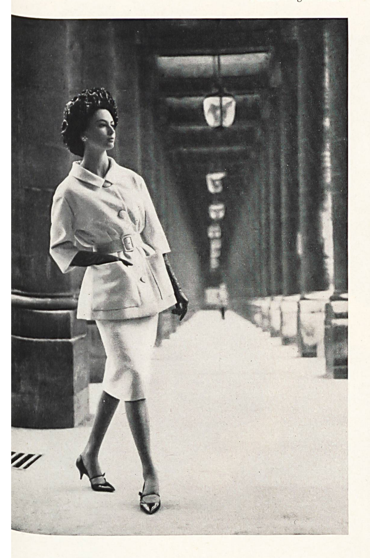
Ensemble printanier en toile fibranne jaune. MODÈLE JACQUES HEIM