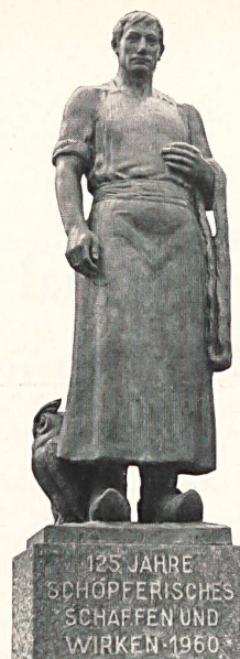
The dyer's statue, on the Heberlein fountain, at Wattwil