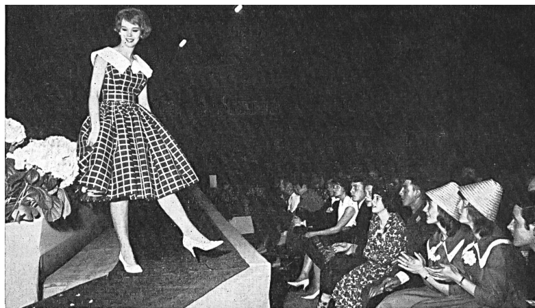
A photograph taken during the fashion show.

by a fashion parade showing some fifty Swiss couture and ready-to-wear models, all made of Stoffels fabrics.