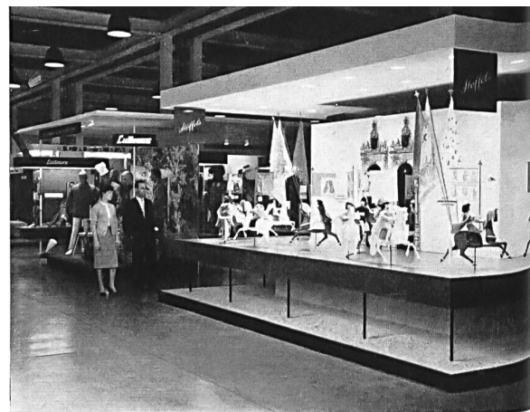
The stand of Stoffel & Co., St. Gall

Apart from the sector made up of individual stands, in which the exhibits are generally of a very high stand-