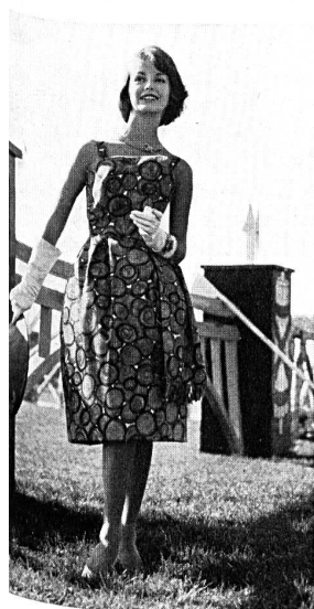
METTLER & CIE S. A., SAINT-GALL

Organdie with chenille embroidery Modèle Gack, Zurich