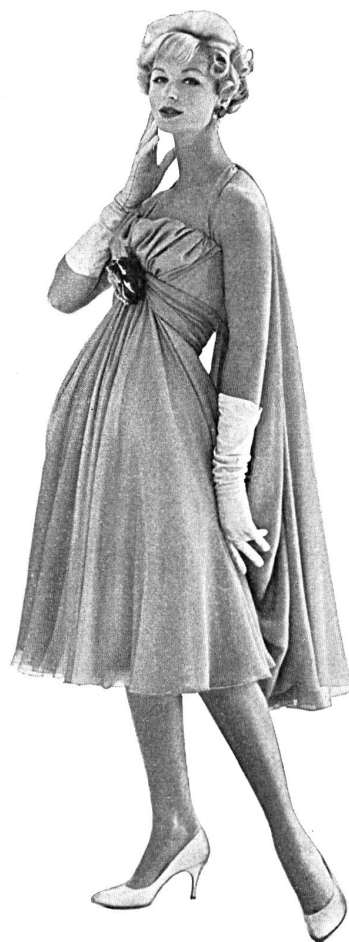
L. ABRAHAM & CO. SILKS LTD., ZURICH

Silk chiffon Chiffon de soie Modèle Werlé, Los Angeles