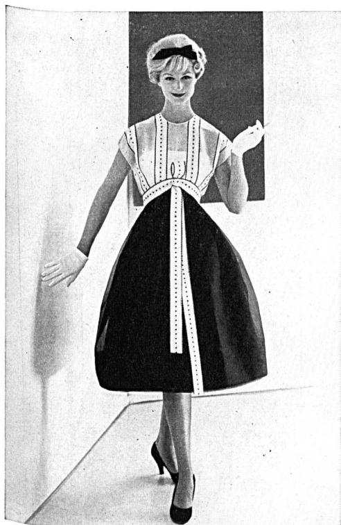
RUDOLF BRAUCHBAR & CIE LTD., ZURICH

Silk chiffon Chiffon de soie Modèle Werlé, Los Angeles