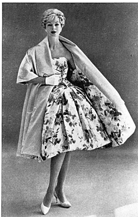
L. ABRAHAM & CO. SILKS LTD., ZURICH

Silk embroidered organdy (top), silk taffetas with silk organdy over the taffeta (skirt) Organdi de soie brodé (blouse), taffetas de soie recouvert d'organdi de soie (jupe) Modèle Werlé, Los Angeles