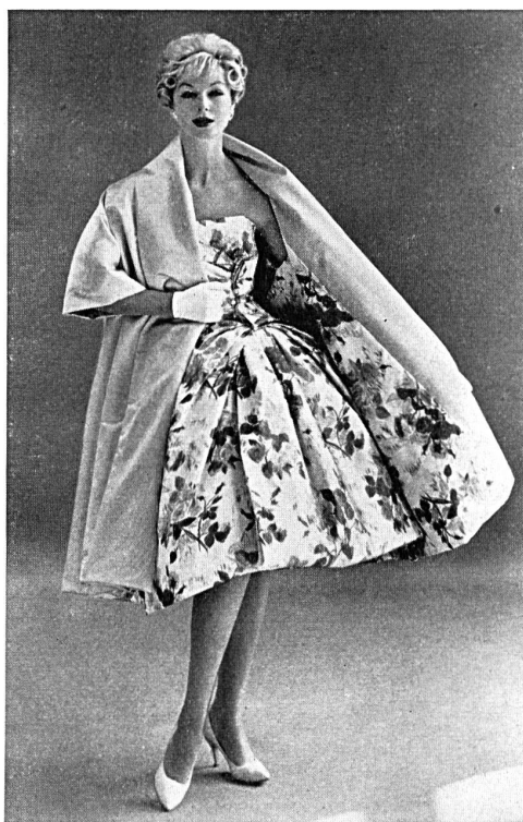
L. ABRAHAM & CO. SILKS LTD., ZURICH

Silk embroidered organdy (top), silk taffetas with silk organdy over the taffeta (skirt) Organdi de soie brodé (blouse), taffetas de soie recouvert d'organdi de soie (jupe) Modèle Werlé, Los Angeles