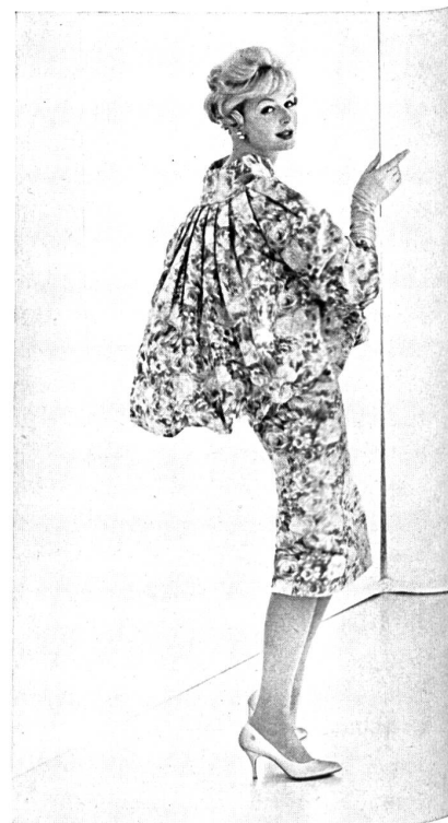
L. ABRAHAM & CO. SILKS LTD., ZURICH

The House of Werlé has specialized from the beginning in fine, imported fabrics that give its fashions a unique flavor combined with the « je ne sais quoi » of California styling. The resulting success has confirmed this designer in his policy and has resulted in increased purchases from abroad with a large part of its total coming from