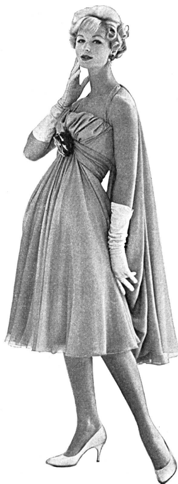
L. ABRAHAM & CO. SILKS LTD., ZURICH

Silk chiffon Chiffon de soie Modèle Werlé, Los Angeles