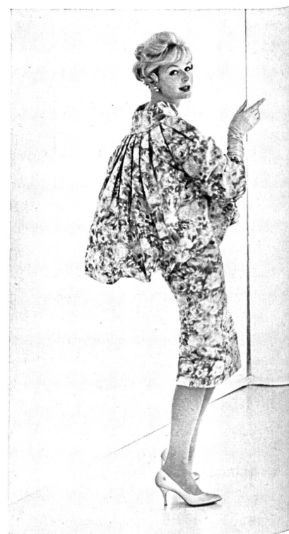
L. ABRAHAM & CO. SILKS LTD., ZURICH

The House of Werlé has specialized from the beginning in fine, imported fabrics that give its fashions a unique flavor combined with the « je ne sais quoi » of California styling. The resulting success has confirmed this designer in his policy and has resulted in increased purchases from abroad with a large part of its total coming from