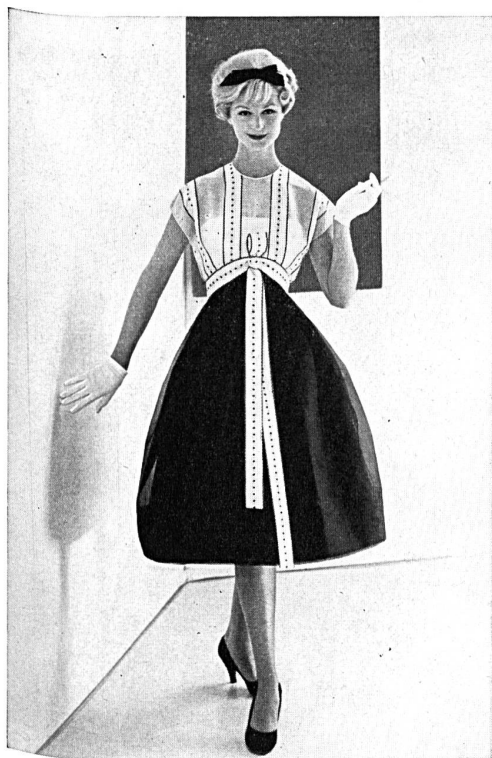
RUDOLF BRAUCHBAR & CIE LTD., ZURICH

Silk chiffon Chiffon de soie Modèle Werlé, Los Angeles