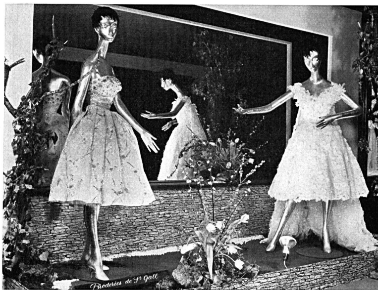
The display of embroideries in the theatre lounge