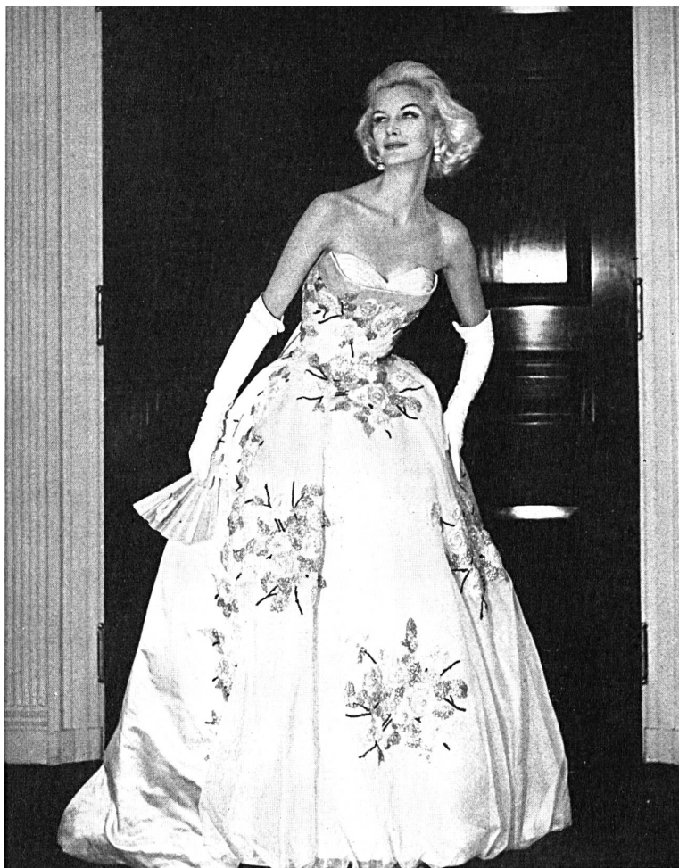
FOSTER WILLI & CO., SAINT-GALL

The fine cotton fabrics, embroideries, woollens, mixed fabrics and tricots imported from Switzerland owe a considerable part of the excellent reputation they enjoy in American ready-to-wear circles to the continual progress made with regard to finish and dyeing. All the ultra-modern qualities, such as Wash-and-Wear, Drip-and-Dry, No-Iron, are possessed by these Swiss articles, even the fragile embroideries and fine Victorian style cotton fabrics, which are still triumphantly up to date in this era of jet aircraft and atomic power. Cilander of Herisau has