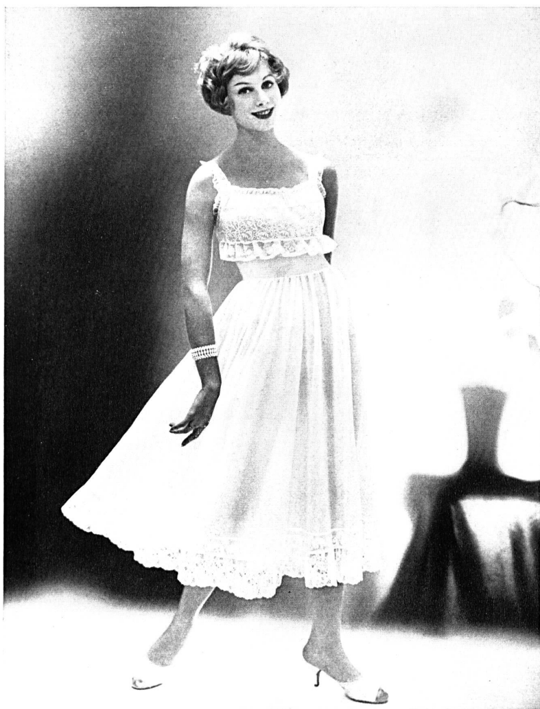
BISCHOFF TEXTILES LTD., SAINT GALL

Embroideries on nylon. Broderies sur nylon. Model by Kickernick, Inc., Minneapolis.