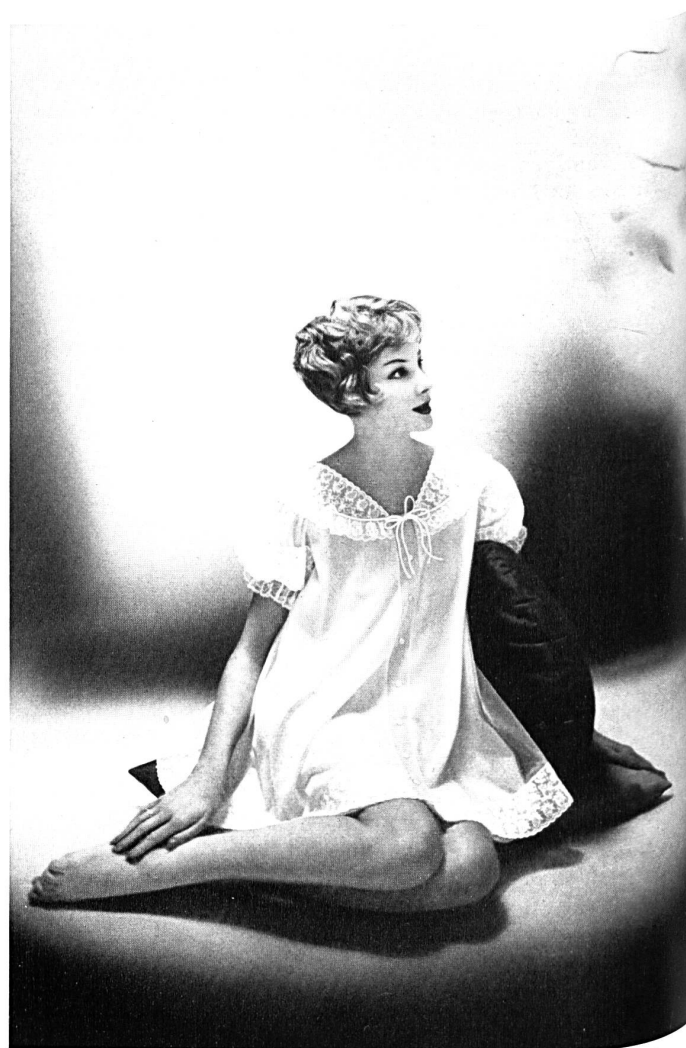
BISCHOFF TEXTILES LTD., SAINT-GALL

Embroideries on nylon. Broderies sur nylon. Model by Kickernick, Inc., Minneapolis.