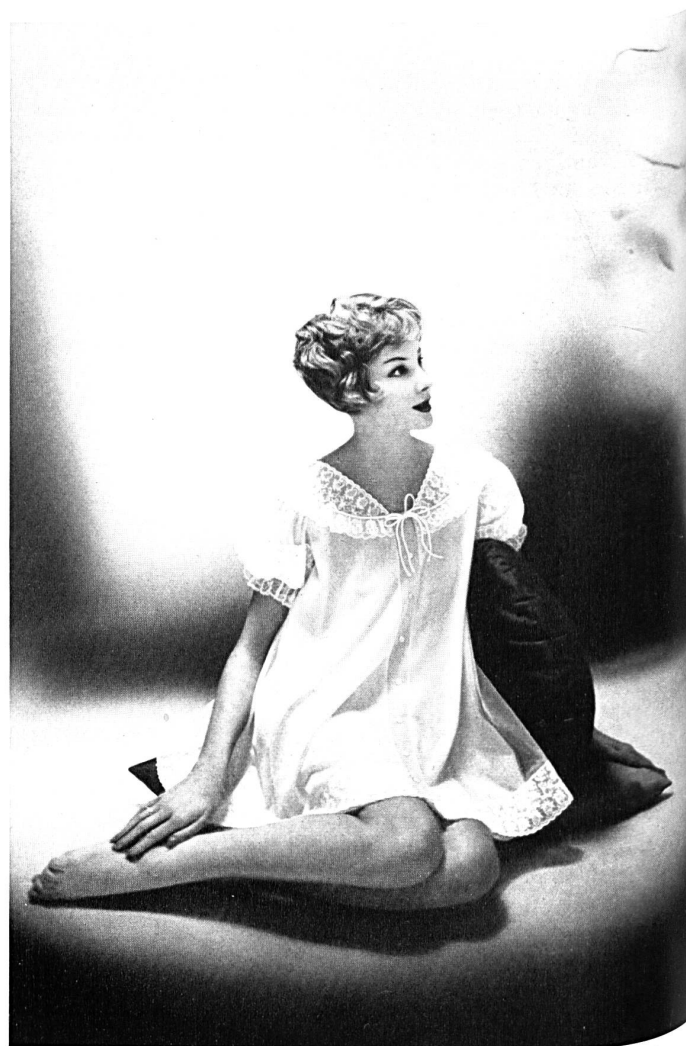
BISCHOFF TEXTILES LTD., SAINT-GALL

Embroideries on nylon. Broderies sur nylon. Model by Kickernick, Inc., Minneapolis.