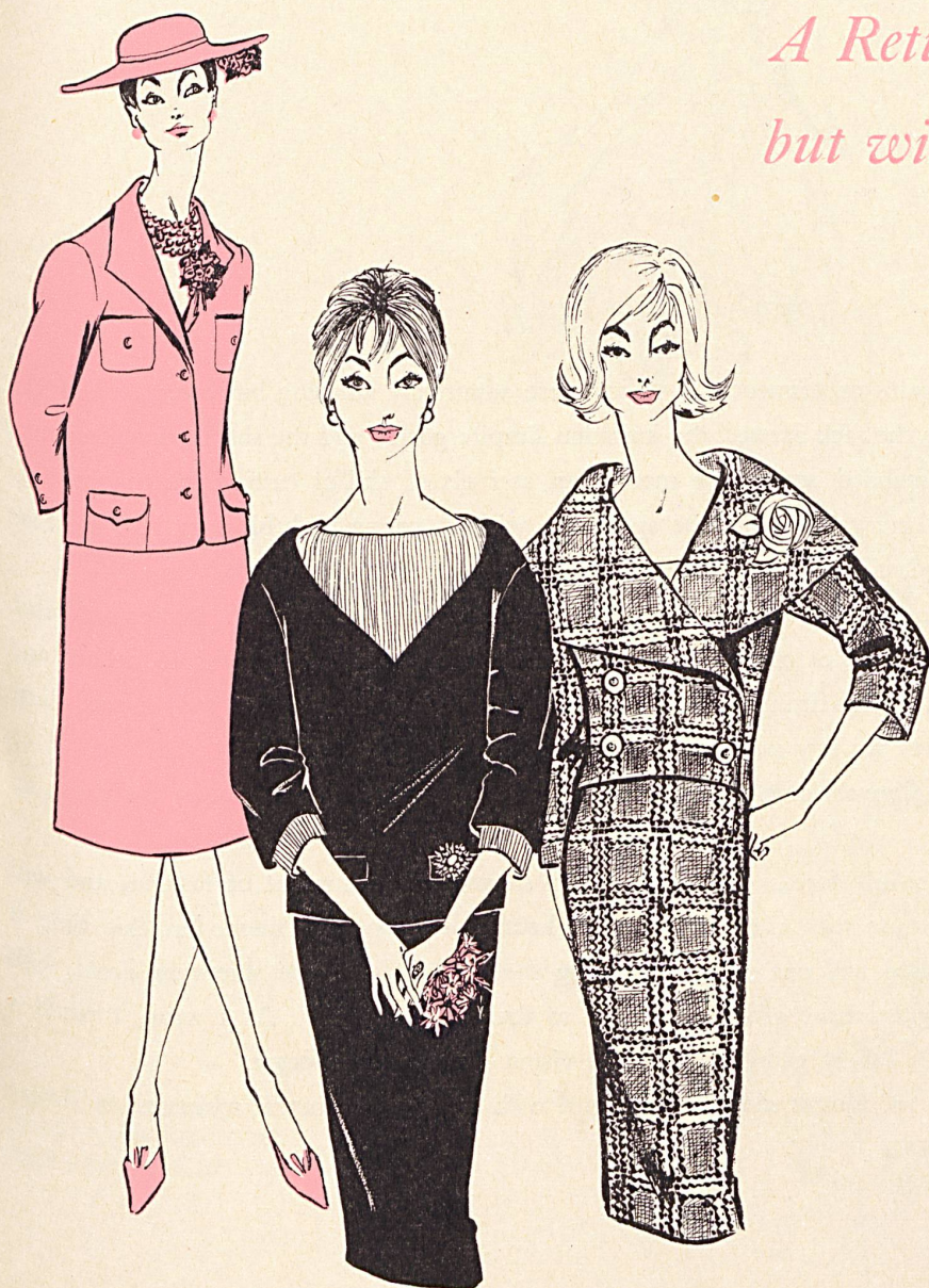
Left : CHANEL Centre : CHRISTIAN DIOR Right : PIERRE CARDIN

A Return to Simplicity... but with what Virtuosity!