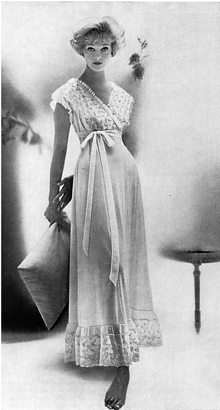
BISCHOFF TEXTILES S. A., SAINT-GALL

Broderie sur chemise de nuit en perlon. Stickerei auf Perlon-Nachthemd. Modèle Margret-Werk, Margrethausen (All.).