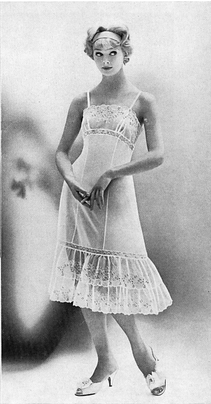
BISCHOFF TEXTILES S. A., SAINT-GALL

Broderie sur chemise de nuit en perlon. Stickerei auf Perlon-Nachthemd. Modèle Margret-Werk, Margrethausen (All.).