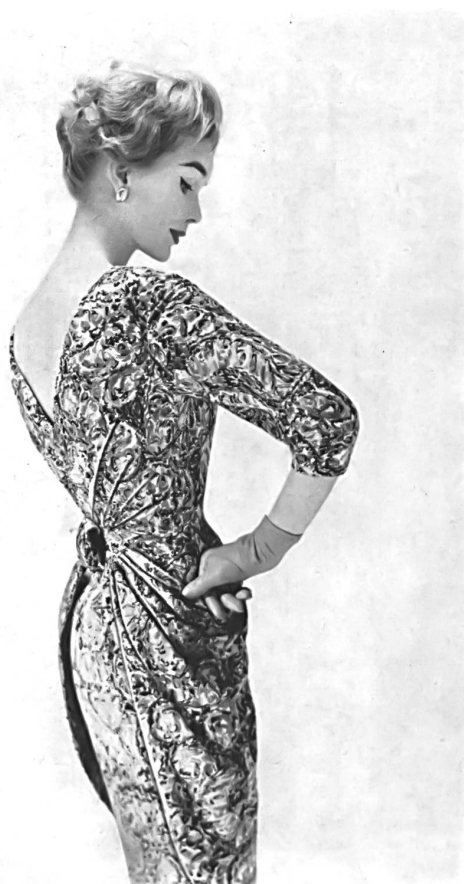
NABHOLZ S. A., SCHÖNENWERD