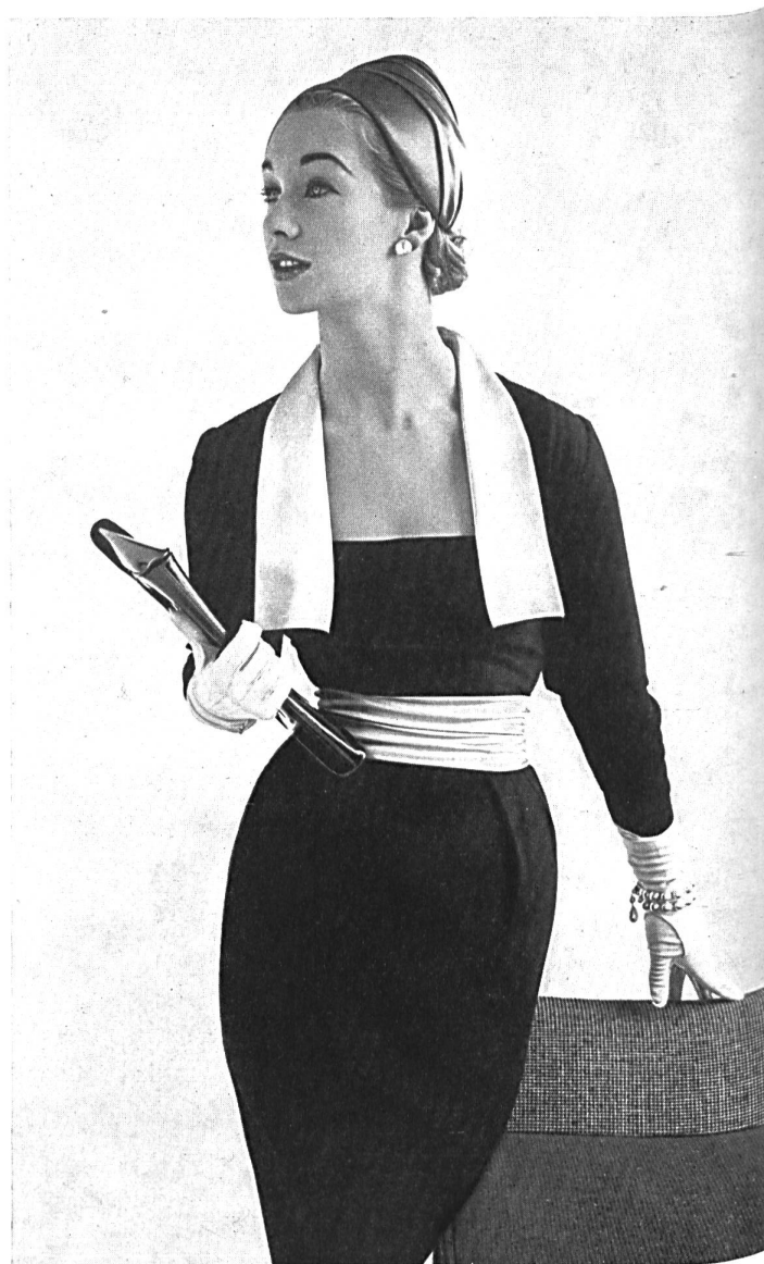
L. ABRAHAM & Co., SILKS Ltd., ZURICH

In the showrooms of one of the major importers of Swiss ready-mades I saw a number of ranges made by various well-known houses and which maintained the quality always associated with them. Wonderful for leisure evenings was a two-piece (by Egeka) consisting of tapering slacks in a Jacquard irregular spot design and