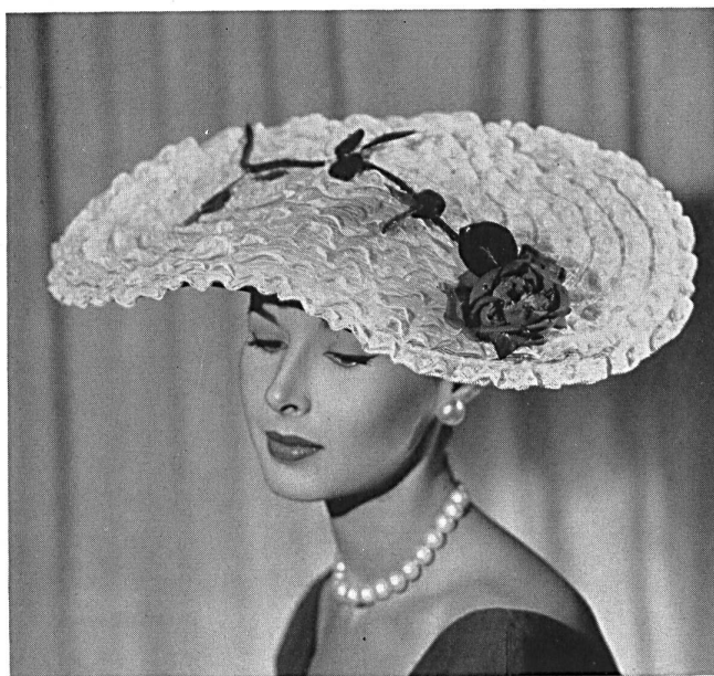
Swiss straw lace

You may remember Rex as the innovator of the be-pearled and be-jeweled sweater. When that fad reached tremendous proportions, Rex went on to the