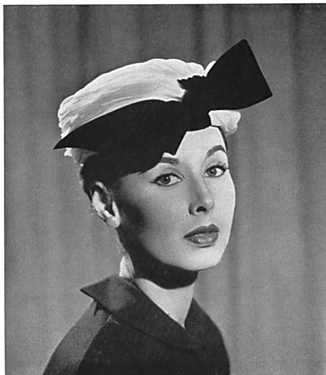
Swiss white organdy