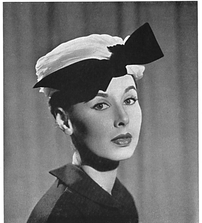
Swiss white organdy