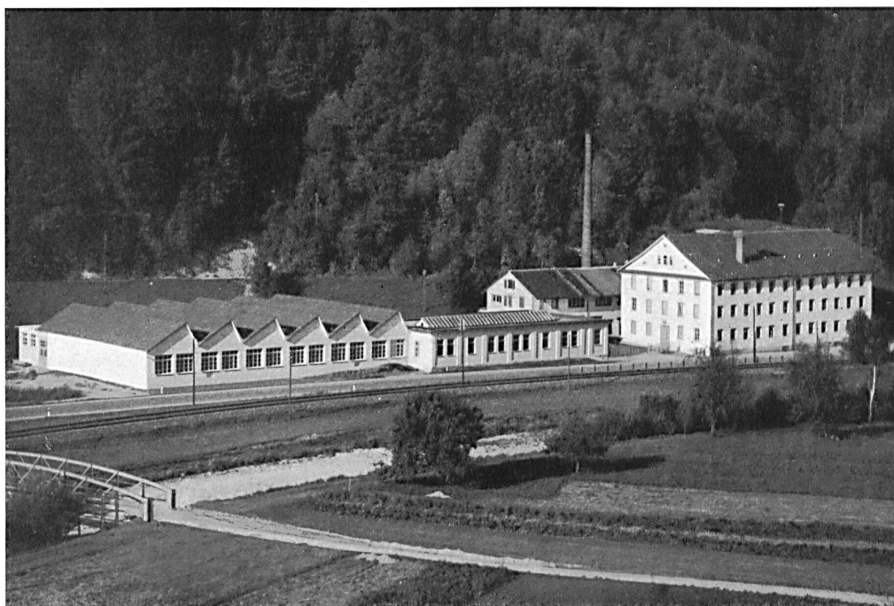
Weaving mills of the firm J. G. Nef & Co. Ltd. in Bauma.