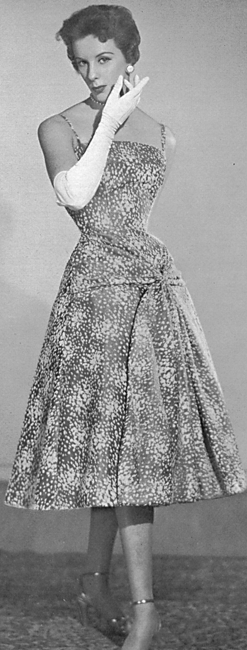
Frederick Starke Ltd., London Silk and rayon mixture by Rudolf Brauchbar & Co., Zurich

later than some twenty or thirty years ago, so that now summer sales and bargains precede the warmer weather ! Although it may be true that the finer qualities are frequently not included in these sales, the unfortunate result is that the sales take place and absorb the money which should be spent on normal stock at normal prices. Summer sales should not take place in early June before the warmer weather starts but just previous to the main holiday period, namely late July and August. Winter coats and suits are already