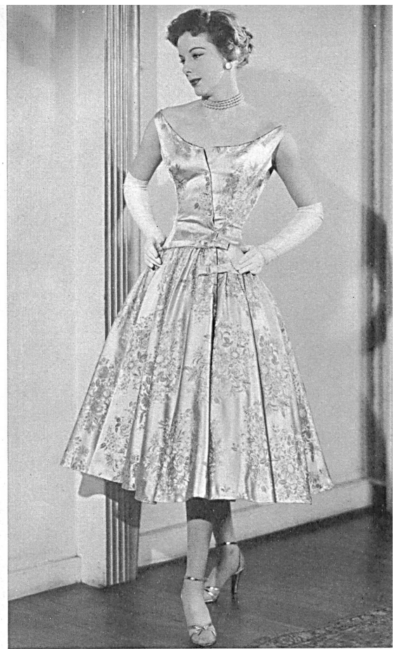
Frederick Starke Ltd., London Woven rayon by L. Abraham & Co., Silks Ltd., Zurich

beginning to appear in the first days of August in some London shops — although we may still have to face another heatwave or two !