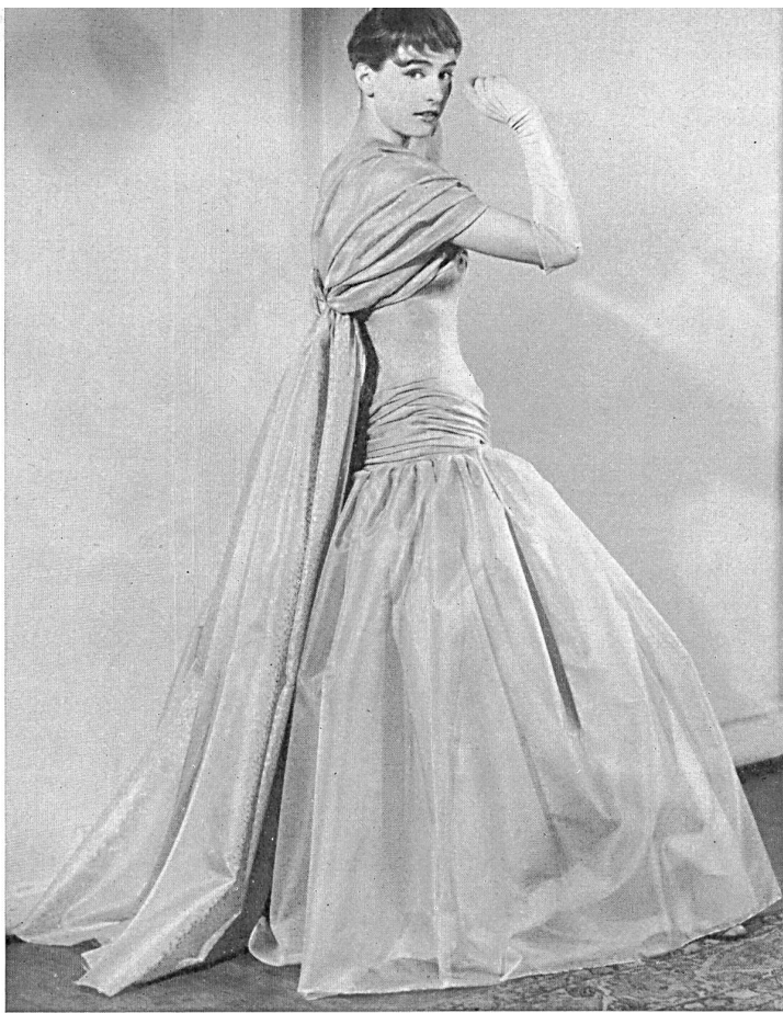
Frederick Starke Ltd., London Pure silk organza by L. Abraham & Co., Silks Ltd., Zurich