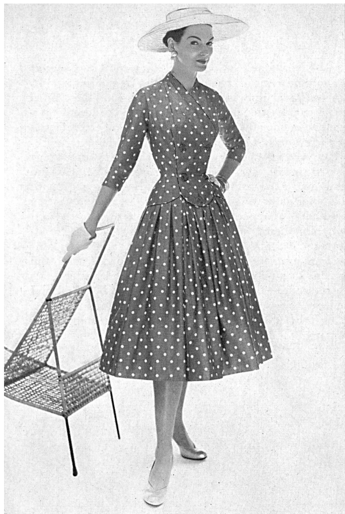
Pierre Balmain Inc., New York

Sales of imported fabrics sold by the yard in retail stores are also brisk, in spite of the slight difference in price which favours the home-produced article. The number of American women who make their own clothes has increased in recent years and this new class of consumer has become more exacting with regard to the quality of the fabrics it chooses; this is characteristic of the new generation of American women. The Swiss fabrics imported into the United States have the advantage of being new and different, and the ideas they introduce play their part in the seasonal rejuvenation of fashion. It is only the versatility of the industrial system of multiple and comparatively small factories found in eastern Switzerland that makes possible such an incredible variety of designs and textures. Thus the constant flow of fresh ideas from Europe is a vital source of inspiration to the textiles sold in America.