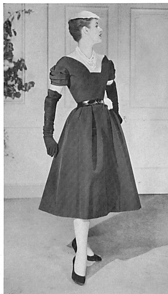
Christian Dior, New York Plain « Amadis » fabric by L. Abraham & Co., Silks Ltd., Zurich.

The present trend in interior decorating is towards frivolity in the worked fabrics for curtains, drapes and furniture. After these fabrics had been out of favour in interior decorating schemes since 1914, it is interesting to see how American decorators are returning to light and embroidered fabrics, like those used in our grandmothers' drawing rooms. This is an understandable reaction against the severity of one-toned walls and curtains in plain neutral fabrics. Embroidered curtains are returning to brighten up windows in both old and modern houses. The designers and embroiderers of St. Gall have succeeded in reviving and adapting to