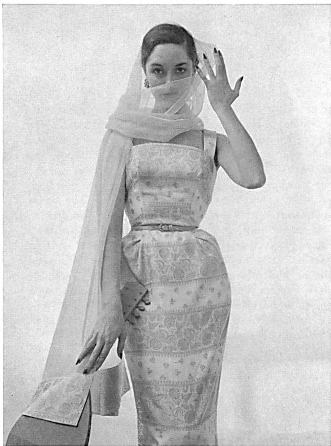
Anna Miller Inc., New York « Sabara » brocade by L. Abraham & Co., Silks Ltd, Zurich.