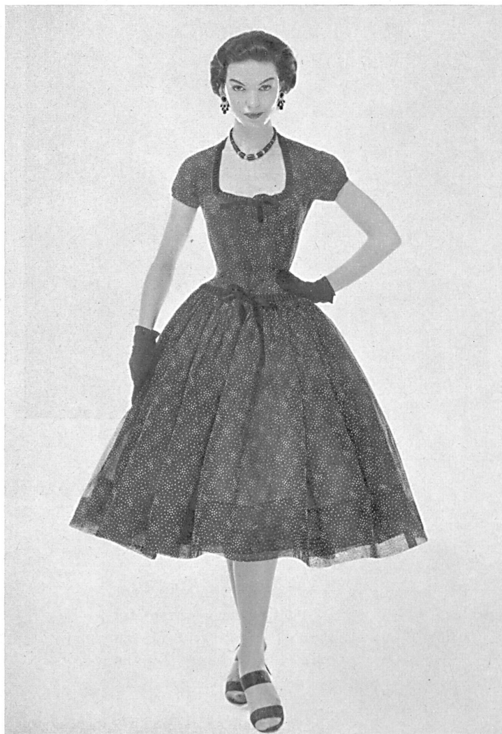
Nettie Rosenstein Inc., New York Flockprinted organdy by Mettler & Co. Ltd., Saint-Gall

of execution. Progress in the field of finishes and dyes has also contributed to making fine cotton fabrics more attractive and more practical than ever. American buyers say that the present high standard of the finishes and dyes has played a great part in increasing the volume of sales and the turnover in dollars.