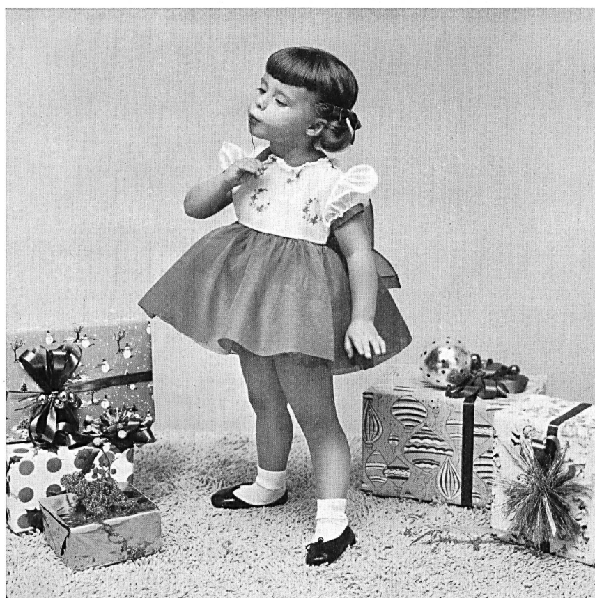
Youngland, New York Embroidered organdy by A. Naef & Co., Flawil Representatives : M. E. Feld & Co., New York