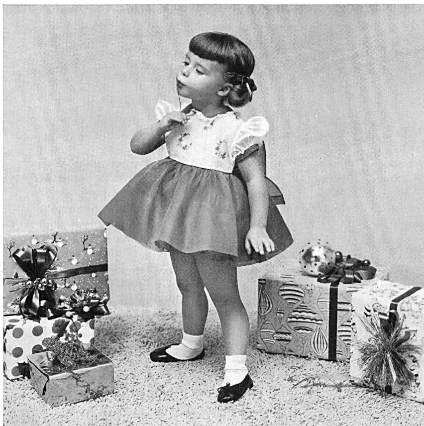
Youngland, New York Embroidered organdy by A. Naef & Co., Flawil Representatives : M. E. Feld & Co., New York