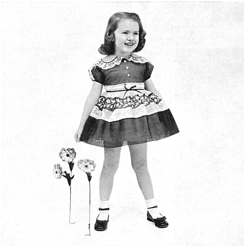
Celeste, New York Embroidered organdy by A. Naef & Co., Flawil Representatives: M. E. Feld & Co., New York

If manufacturers of dresses for children and little girls choose embroideries as beautiful as these, it means that they do not let the comparatively high price of an