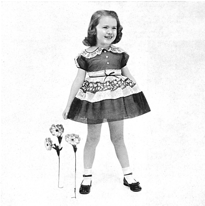
Celeste, New York Embroidered organdy by A. Naef & Co., Flawil Representatives: M. E. Feld & Co., New York

If manufacturers of dresses for children and little girls choose embroideries as beautiful as these, it means that they do not let the comparatively high price of an