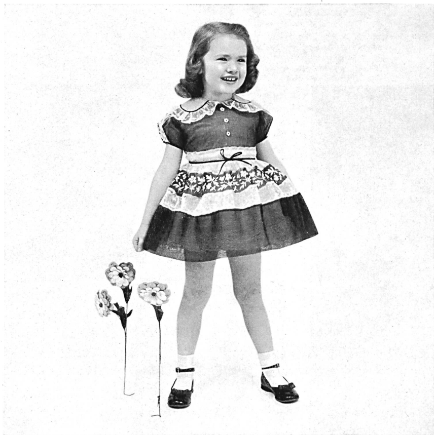
Celeste, New York Embroidered organdy by A. Naef & Co., Flawil Representatives: M. E. Feld & Co., New York

If manufacturers of dresses for children and little girls choose embroideries as beautiful as these, it means that they do not let the comparatively high price of an