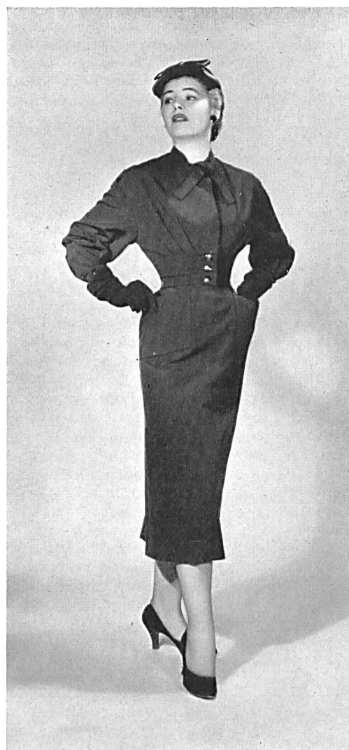
CHRISTIAN DIOR, NEW YORK

« Amadis » silk by L. Abraham & Cie, Soieries S. A., Zurich.