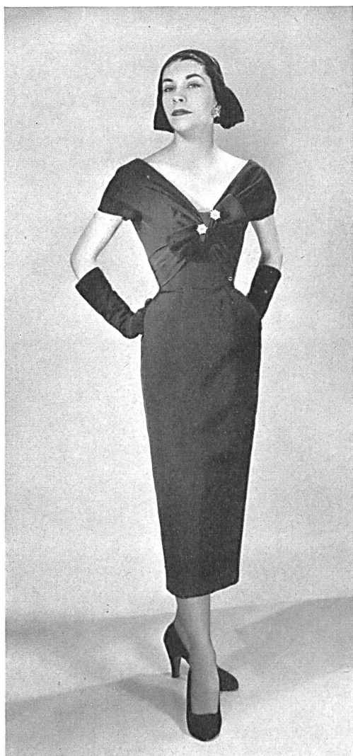
CHRISTIAN DIOR, NEW YORK

« Amadis » silk by L. Abraham & Cie, Soieries S. A., Zurich.