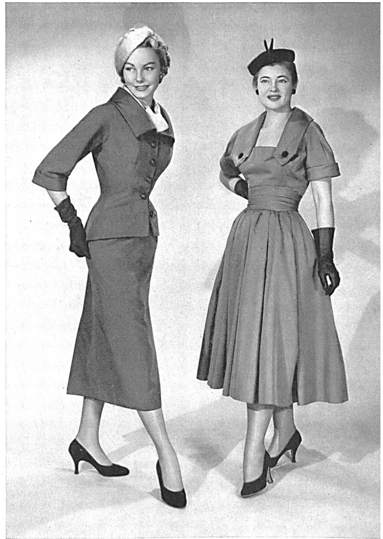
CHRISTIAN DIOR, NEW YORK

American mills and weavers in Switzerland and other European countries are all outdoing one another in ingenuity, and the market is flooded with an extra-