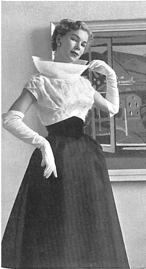
HENSEL & MORTENSEN, BERLIN Fil à fil Directoire knitterfrei von Heer & Co. A.-G., Thalwil.