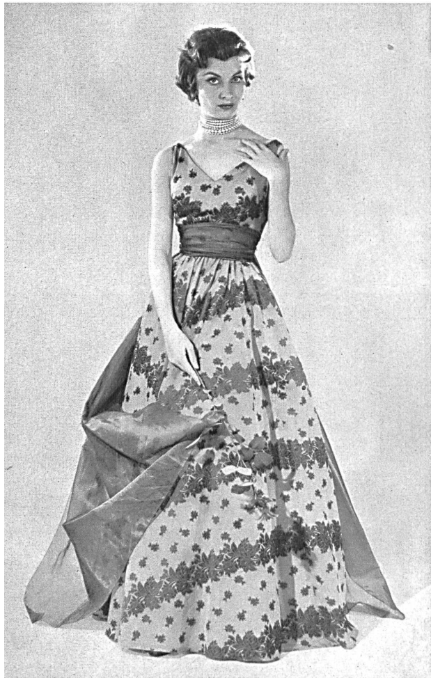
NICOL MODELLER A.-B., GÖTEBORG Organza broché de Rudolf Brauchbar & Cie, Zurich.

For Sweden, Switzerland is an important supplier of textile products and clothing. Like the inhabitants of many other northern countries, the Swedish are appreciative not only of elegance but also of quality; and they know that this quality can be found in Swiss products