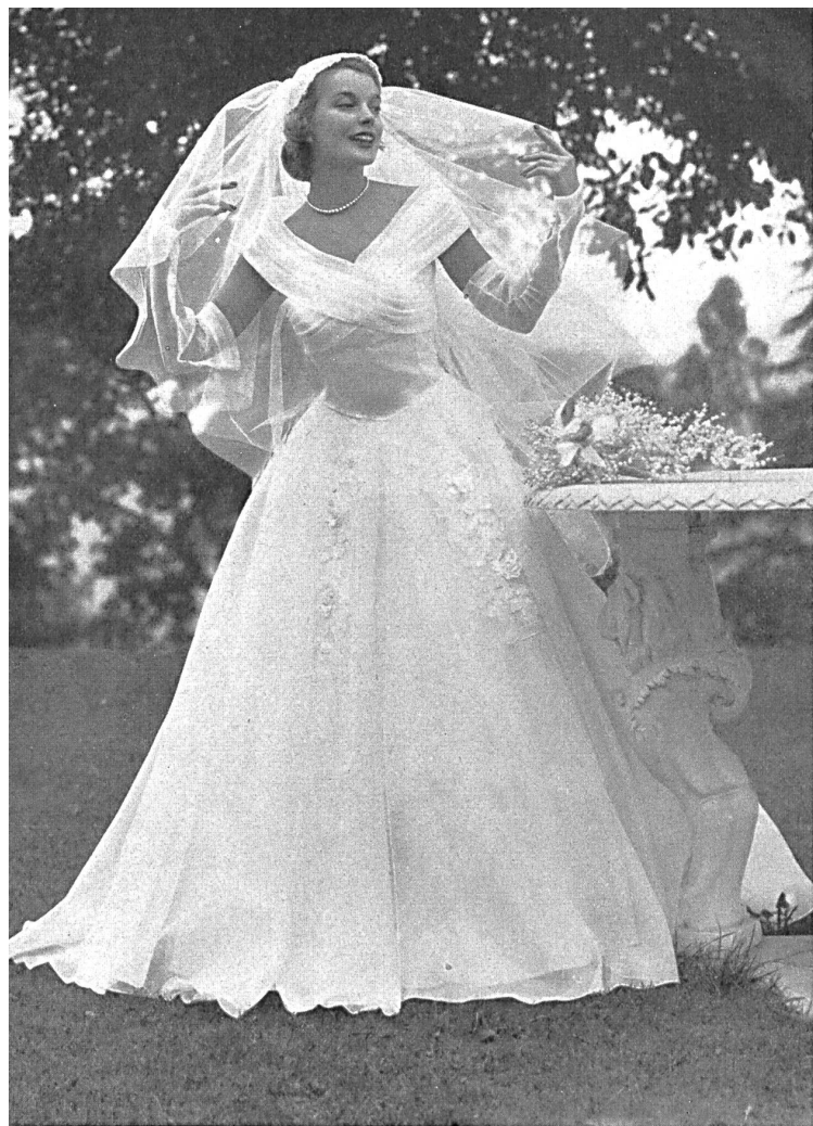
Bridal gown. Embroidered organdy by Forster Willi & Co., St-Gall.

that individual plans may be worked out to help the bride coordinate her trousseau, select china, silver and linens and set up a registry for inquiring friends who are anxious to give gifts that will fit into a harmonious plan for the happy couple's home. Clever store owners have been quick to realize that the Cahill Room brings unlimited expenditures often in remotely related departments, by brides-to-be and their families and friends.