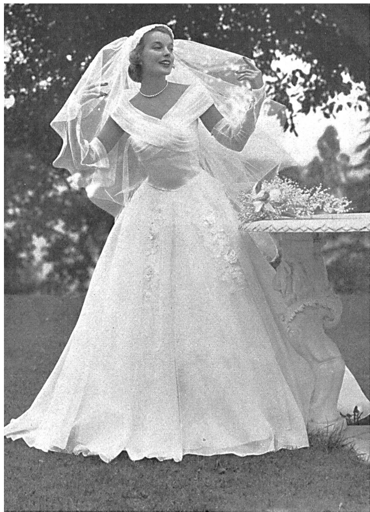
Bridal gown. Embroidered organdy by