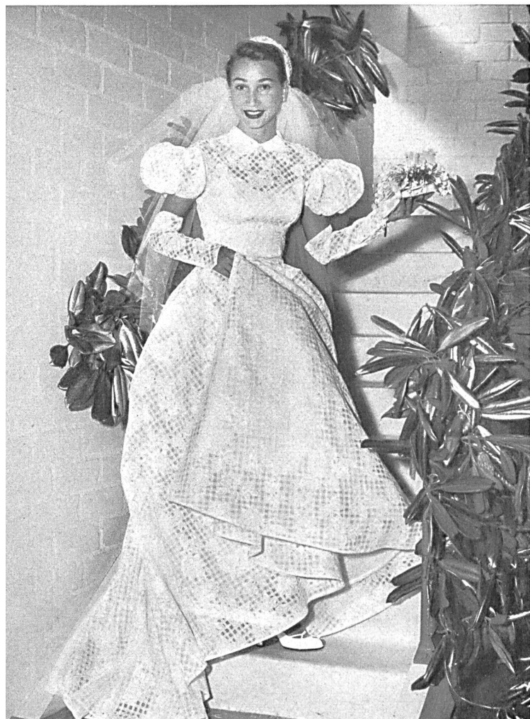
Bridal gown. Fabric by

An interesting sidelight on the business methods of Cahill, Ltd. is the fact that finances are kept in a position to buy anything new or original or highly desirable in