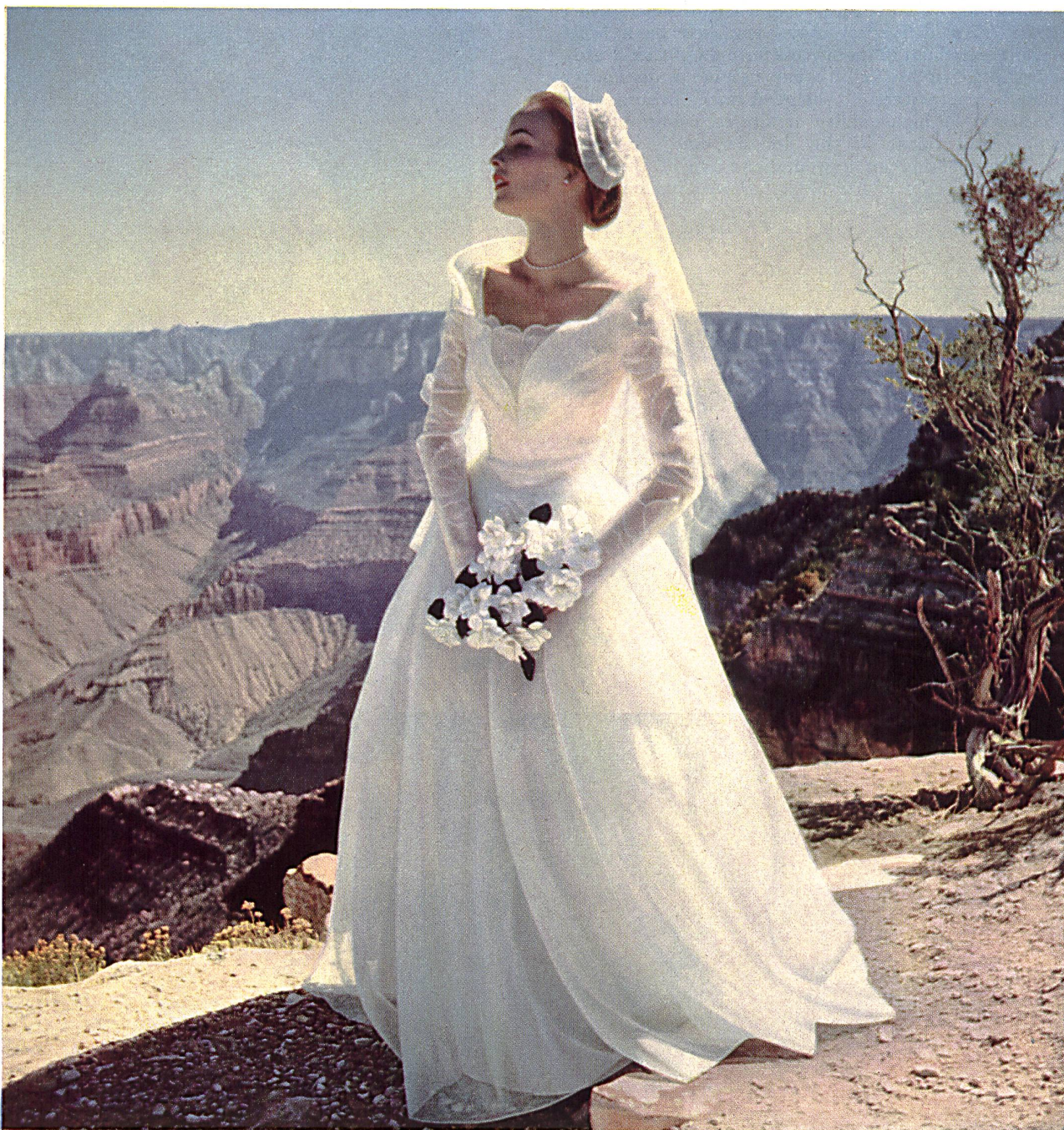
Bridal gown. White sheer cotton fabric by Stoffel & Co., St-Gall.

Swiss goods although there is strict budgeting and pre-planning for domestic goods.