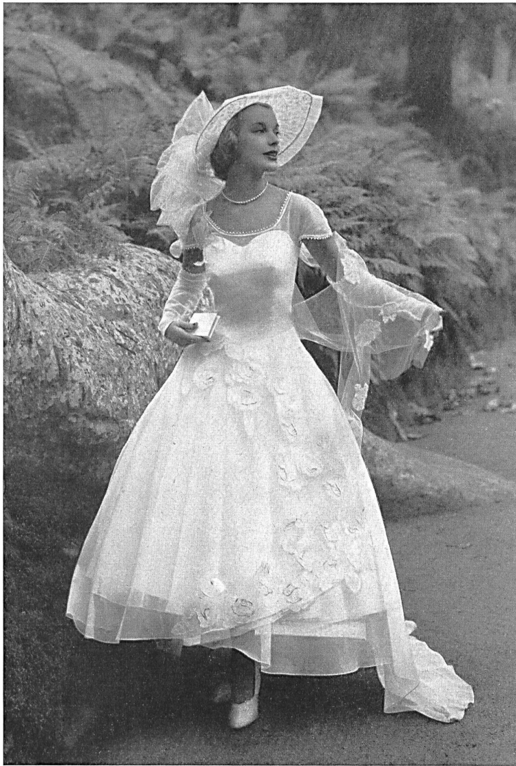
Embroidered organdy with detached flowers by Forster Willi & Co., St-Gall.