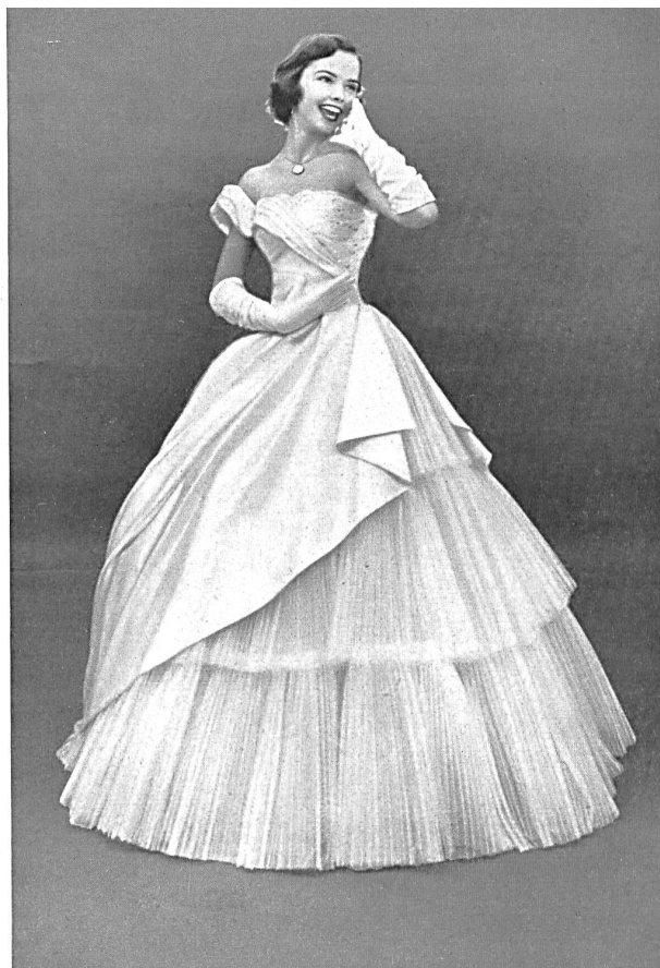
Evening dress in pleated tulle by Swiss Net Company Ltd., Münchwilen.