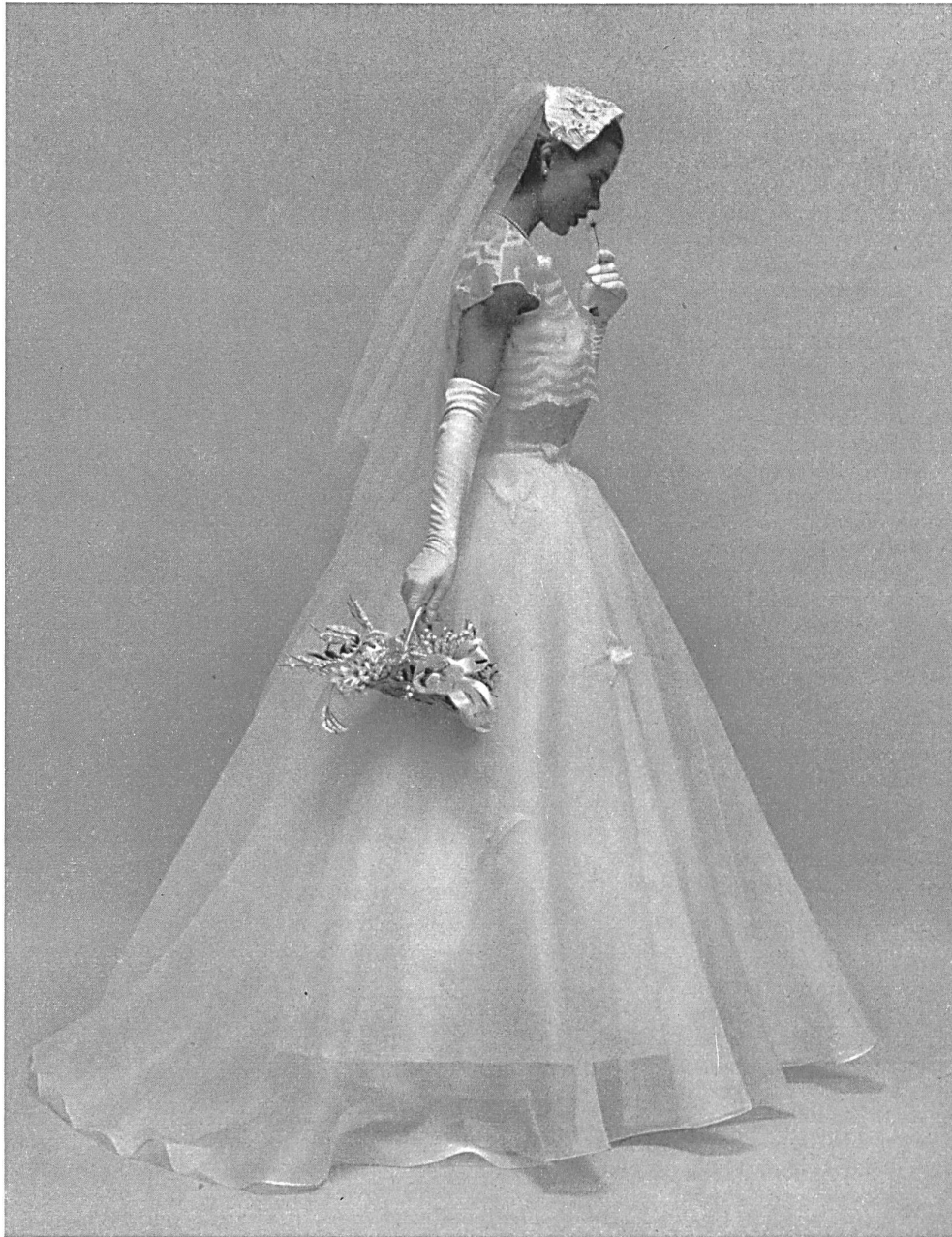
Bridal gown. Embroidered organdy appliquéd on organdy by Jacob Rohner Ltd., Rebstein.