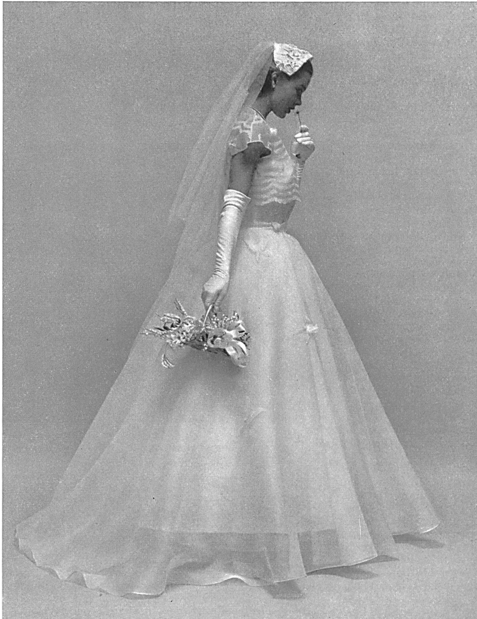
Bridal gown. Embroidered organdy appliquéd on organdy by Jacob Rohner Ltd., Rebstein.