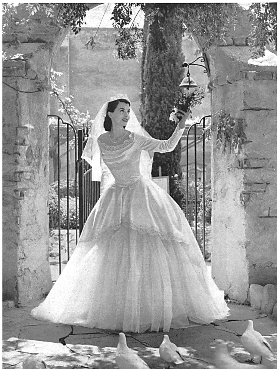
All models are from CAHILL LTD., LOS ANGELES