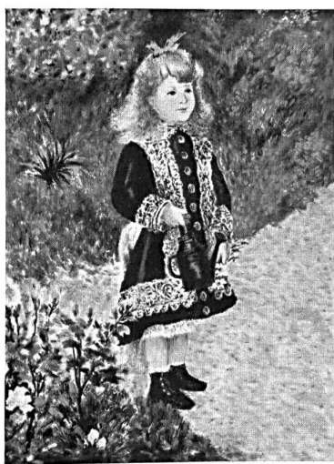
« Small girl with a watering can » by Renoir