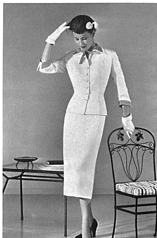
ATHENA White suit of Swiss synthetic fabric