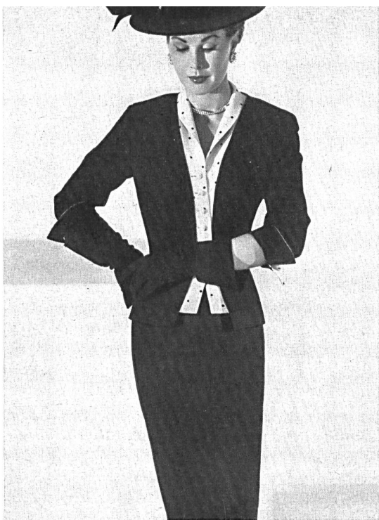
ATHENA Swiss shantung suit with linen insert

This is a season of potpourri — of a rehash of old ideas, of a return to many design lines of the late thirties, a season when anything goes and most of it will.