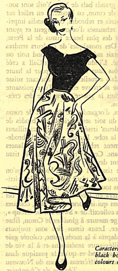
Characteristic line of this season: black bodice and skirt with bright colours on a clear background.

Let us take, for example, the field of printed fabrics.