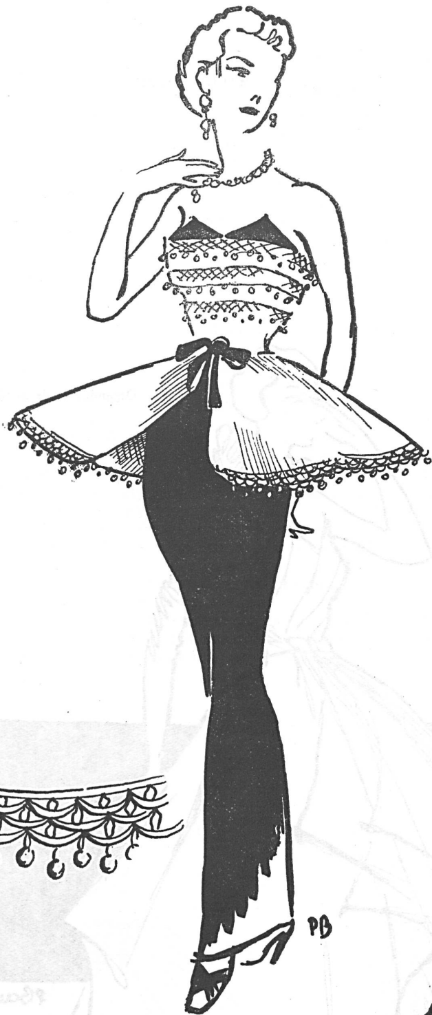
Basque et corsage en toile glacée ornés de broderie suisse.