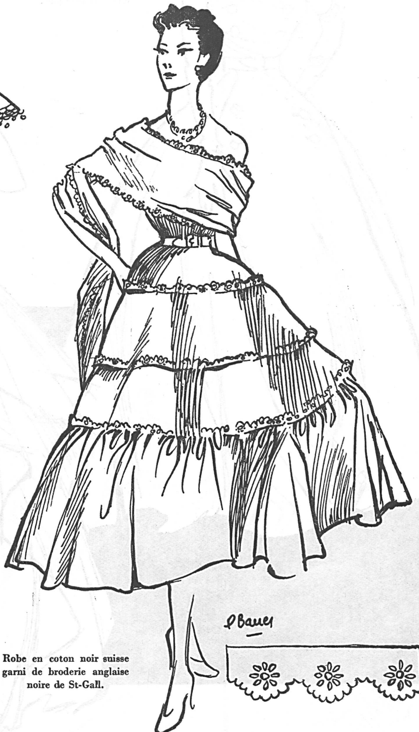
Robe en coton noir suisse garni de broderie anglaise noire de St-Gall.