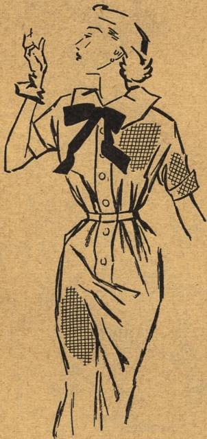
Shirtwaist dress in blue checked taffeta by Mollie Parnis, New York.

Taffeta is popular just now and is being used to make dresses, suits, blouses, linings and a thousand accessories. In the collections of splendid taffetas from Zurich, what is particularly striking is the quality of the fabric, its suppleness and the infinite variety of its colours. Manufacturers have all the