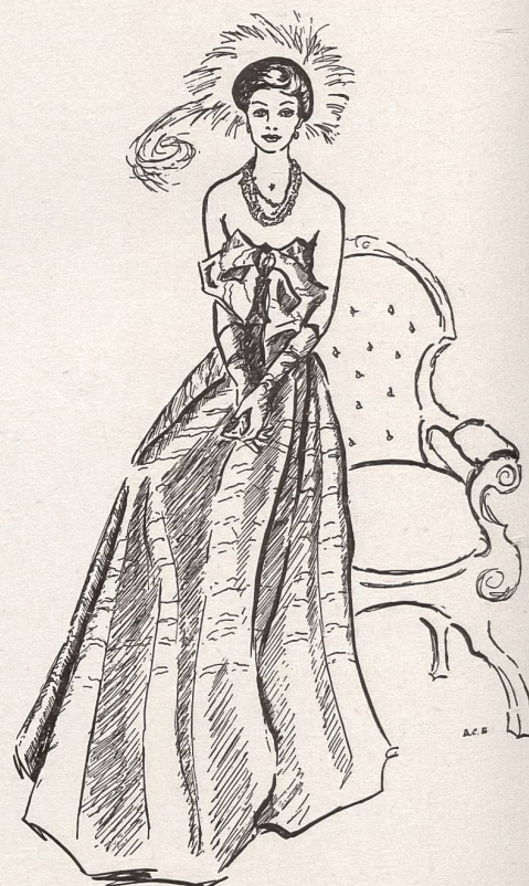
Roecliffe & Chapman, Londres. Evening dress of swiss plissé satin.