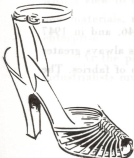
« Paris »