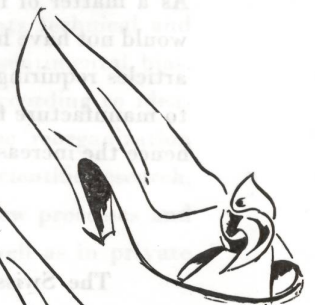
« New-York »