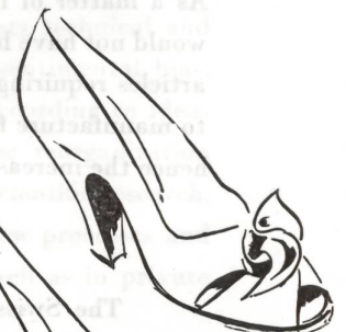
« New-York »