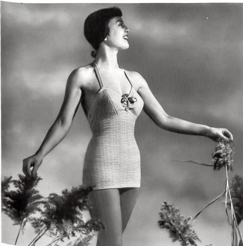
Nabholz Ltd., Jersey-Manufacturers, Schönenwerd (Sol.).