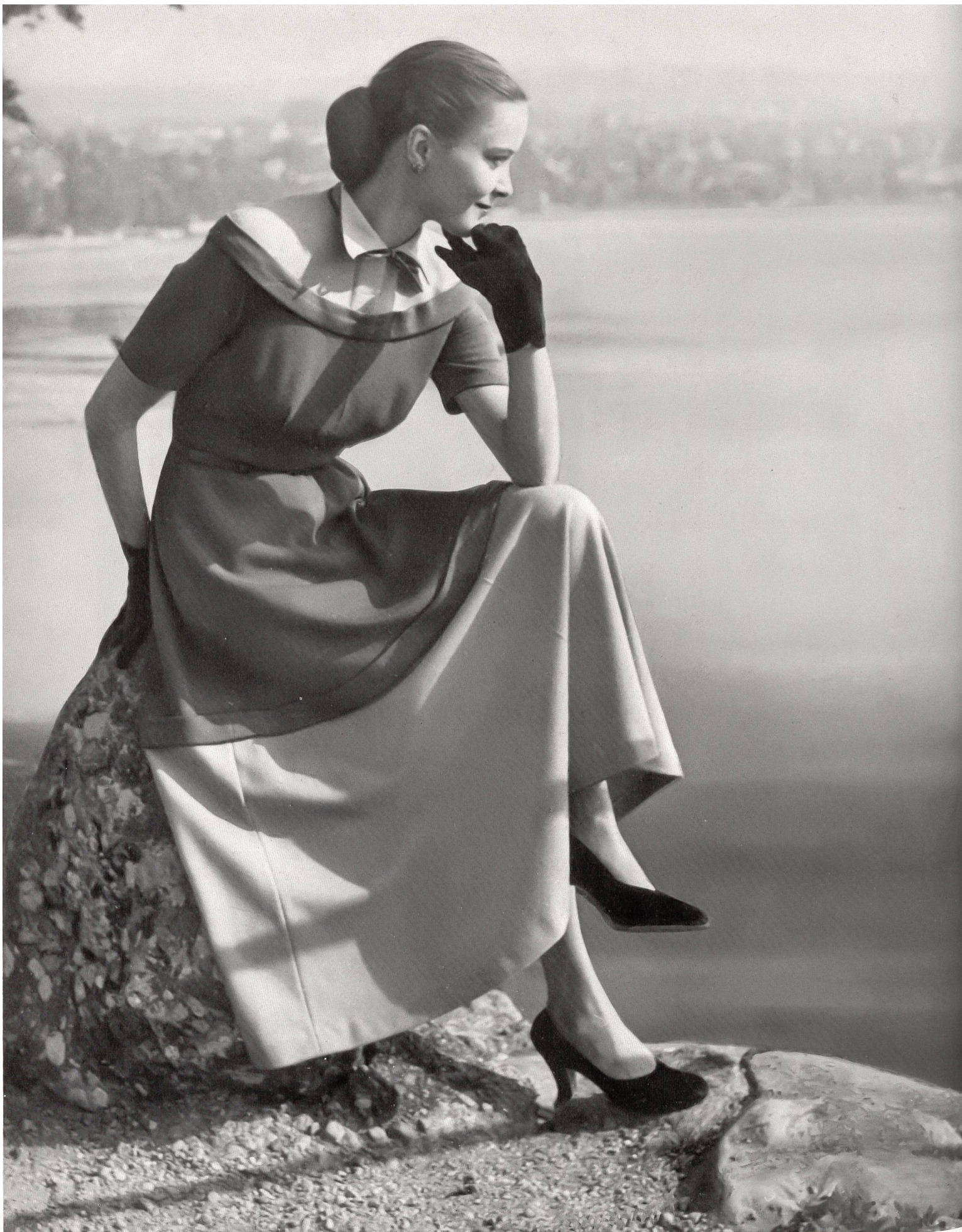
Nabholz Ltd., Jersey-Manufacturers, Schönenwerd (Sol.).