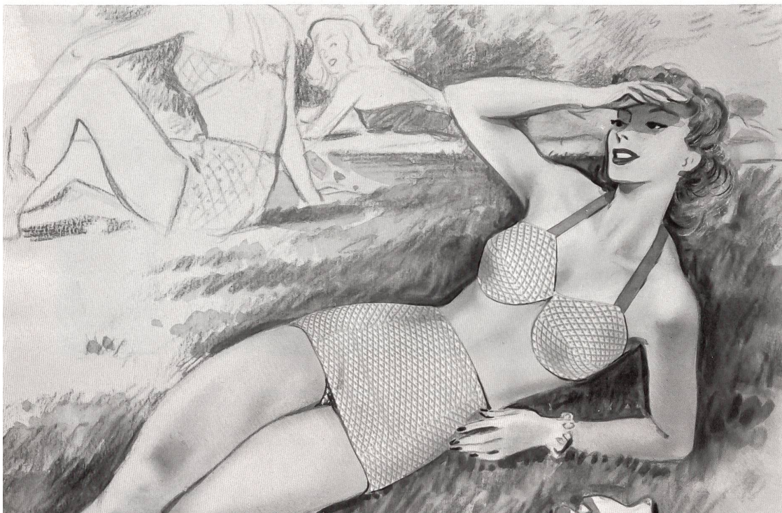
C. Burgi & Cie, Kreuzlingen.

Modern styled bathing suits of extremely careful cut, models with or without skirt.