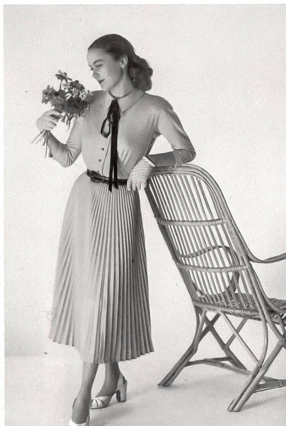
Vollmoeller, Uster Knitting Works Uster.

Youthful jersey frock for spring wear: rounded shoulder line, black velvet bow, patent leather belt and pleated skirt.