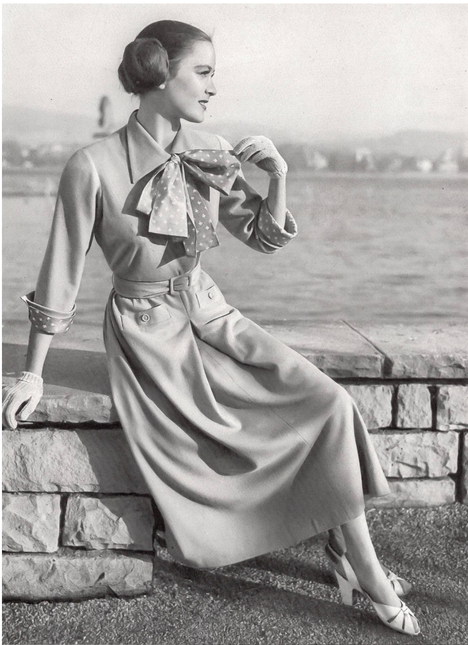
Vollmoeller, Uster Knitting Works Uster.

Smart little spring model in dainty hued jersey fabric; matching printed tussore bow and cuffs.