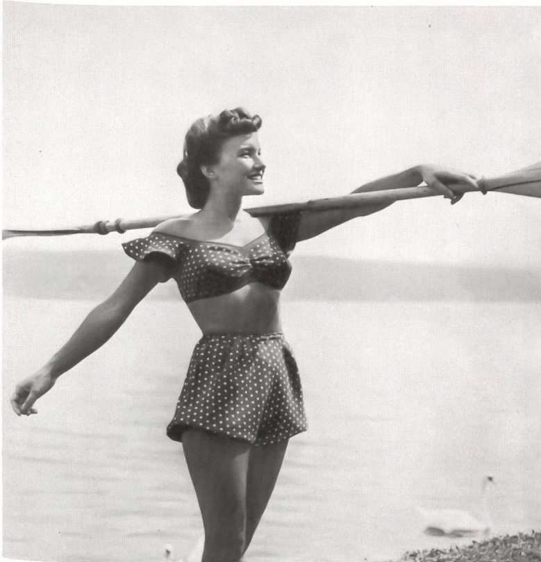
Limited Company formerly W. Achtnich & Co., Winterthur «SAWACO»

Bathing suits, knitted and stockingette garments and underwear.