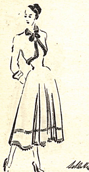
A Fred Schlatter model in Swiss fabric