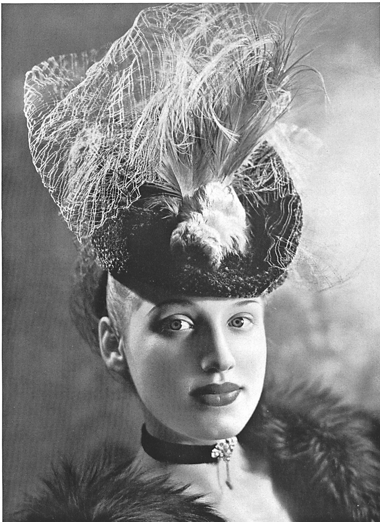
Jacques Isler & Cie S. A., Wohlen. Modèle Charles Muller S. A., Zurich.