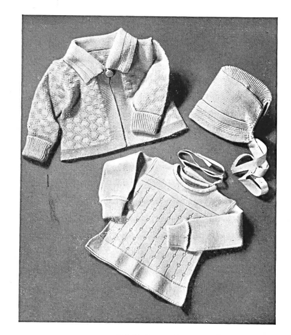
,, molli " Knitwear. Ruegger & Co, Zofingen.

Extremely practical as the remarkable creations placed on the market by Swiss manufacturers are, they are none the less noted for their figuremoulding lines. Undies, nightgowns and every kind of luxury lingerie are often trimmed with lace or embroidered tulle. In some cases the trimming consists of sun-ray tucks or frills of the latest style.