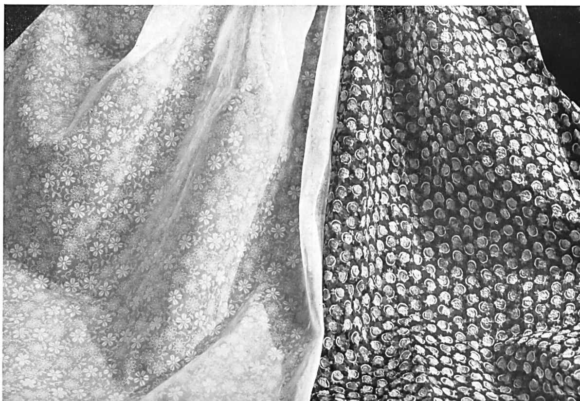
Dress Materials. Taco Ltd., Zurich.

Whatever happens Fashion always remains faithful to organdy, and creates the most fascinating models that have all the daintiness and suppleness of the material itself: either in white with raised embroidery and transparent rainbow colours, or in soft, quiet shades for summer afternoon and evening frocks. There