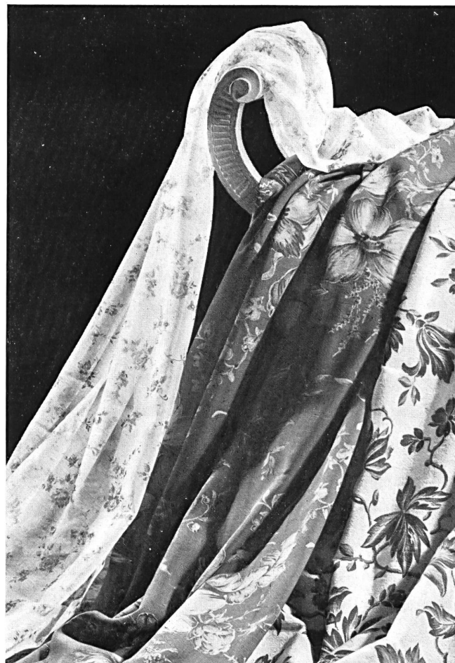
Materials for Curtains and Upholstery. Emil Anderegg Ltd., St-Gall.

Bedspreads have a stiff lining, and are bordered with flounces. They are suited in colour and style to the room, as are also the curtains and cushions. All these requisites, though made of inexpensive materials, combine in producing true artistic effects. Furnishing materials and bath-towelling, a strange