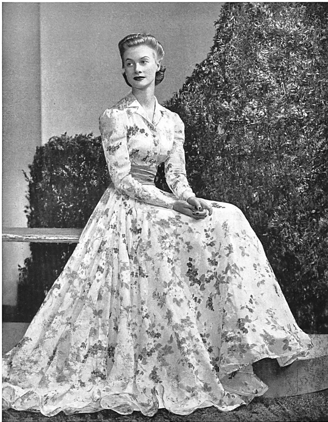
Dress in Swiss Organdy by Herbert Sondheim, New York.

A RTISTIC inventive genius and the perfection of technique were sponsors to Swiss cotton fabrics. The materials and colours in this year's collections are real marvels: delightfully simple on the one hand, with only one aim in view, and striking, novel effects on the other hand, -effects such as we find them constantly in the creations of Swiss manufacturers.