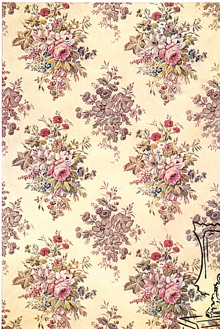
Chintz by Stoffel & Co., St-Gall.