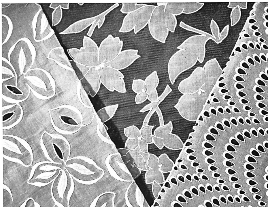
Embroidered fabrics by C. Foster-Willi & Co., St-Gall.