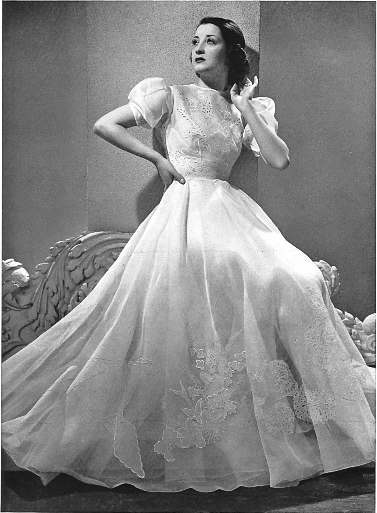
Model Ardanse, Paris. Tissue created by Union Co. Ltd., St. Gall.

But Fashion, an ever-faithful follower of the edicts of Progress, always adapts itself to the actual tendencies of the moment. Thus it is not surprising that one of the greatest successes of today is the dress executed in Broderie Anglaise. Charming effects can be achieved by the clever assortment of bright designs on dark grounds, such as a brown ground embroidered with lemon, or a navy-blue embroidered with rose, with pale-blue or white.